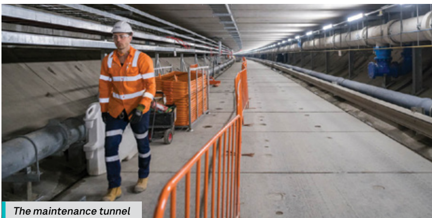
The maintenance tunnel