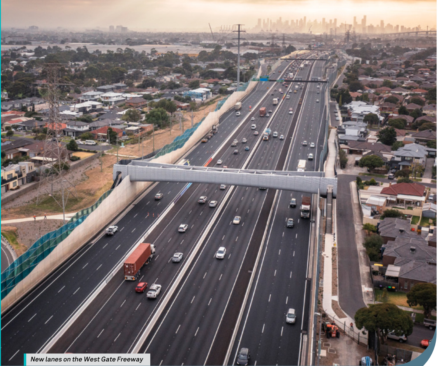
New lanes on the West Gate Freeway