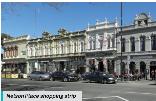
Nelson Place shopping strip