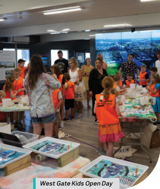
West Gate Kids Open Day