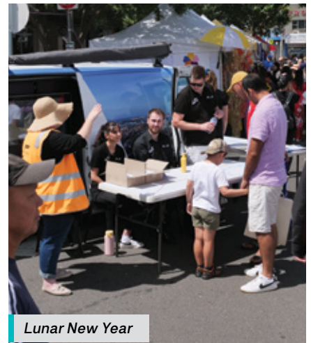
Lunar New Year

As the project gets closer to completion, we will continue to be out amongst the community so keep an eye out for where we are next at next pop-up or outreach event.