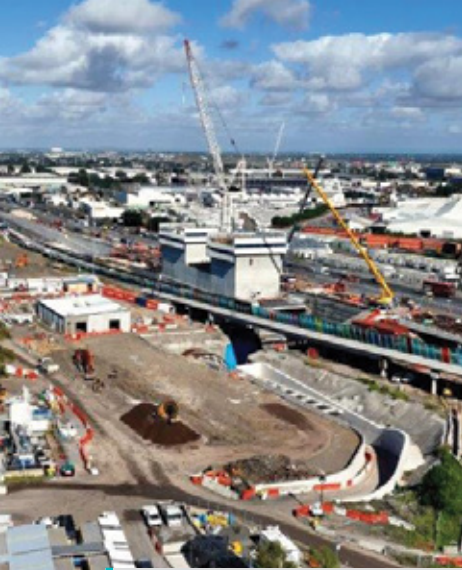
Westbound portal taking shape