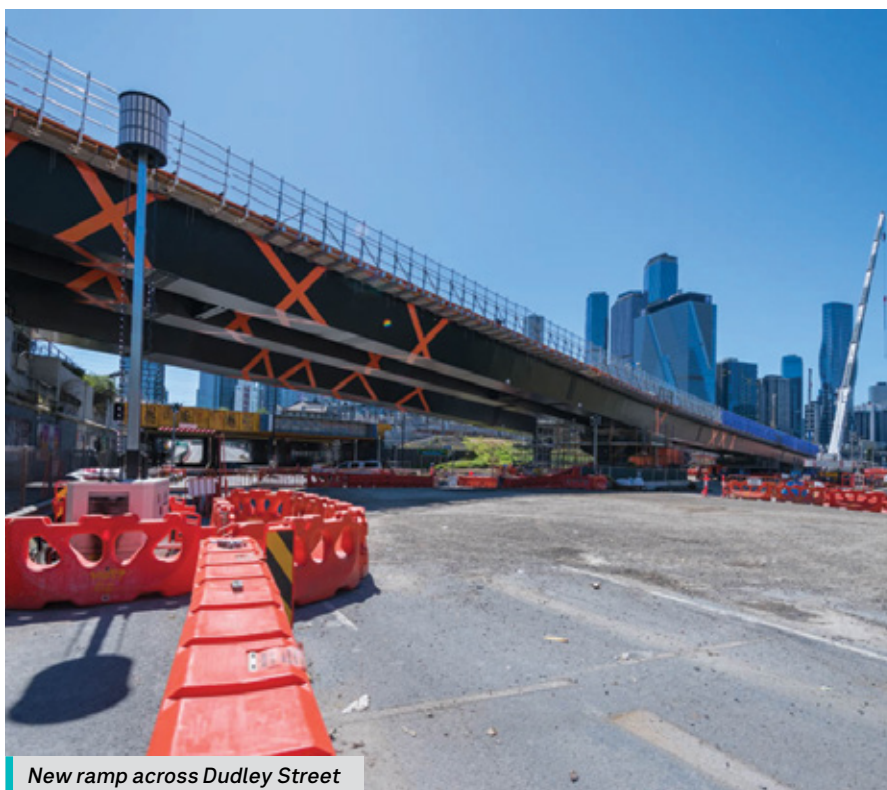
New ramp across Dudley Street