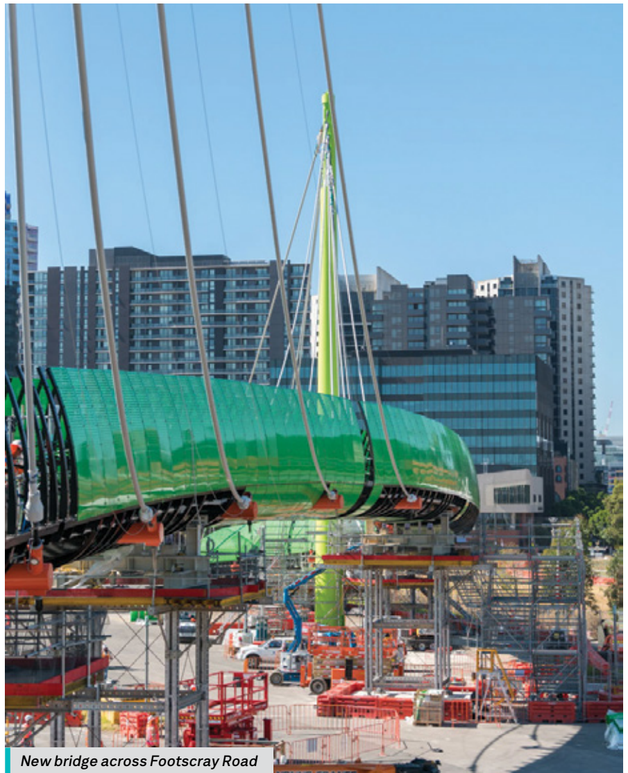
New bridge across Footscray Road

Crews then installed the 482 tonne steel beams over Footscray Road, and finally completing the construction of the bridge by installing the support cables.