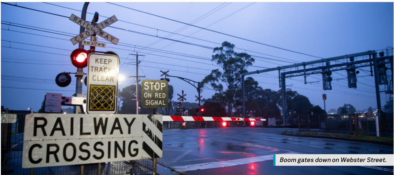
Boom gates down on Webster Street.

Scan the QR code or visit levelcrossings.vic.gov.au/webster-street to read the consultation report.