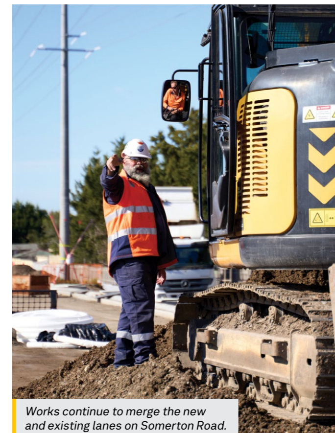
Works continue to merge the new and existing lanes on Somerton Road.