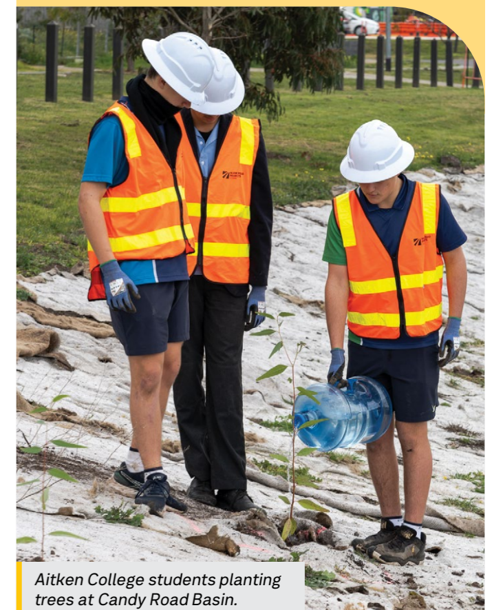
Aitken College students planting trees at Candy Road Basin.