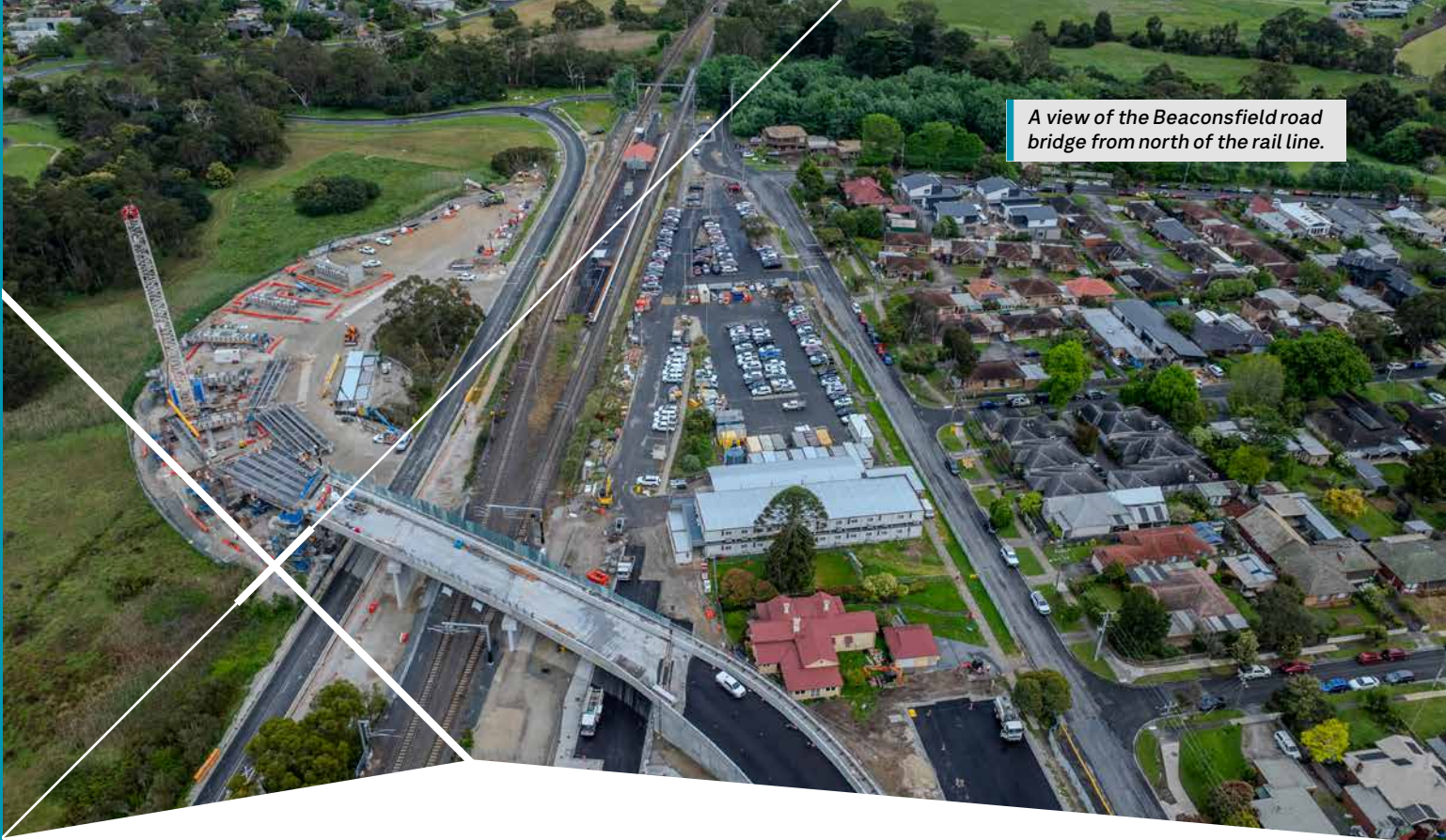
A view of the Beaconsfield road bridge from north of the rail line.

Station Street, Beaconsfield / December 2024