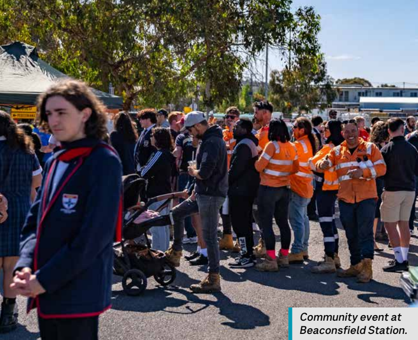
Community event at Beaconsfield Station.