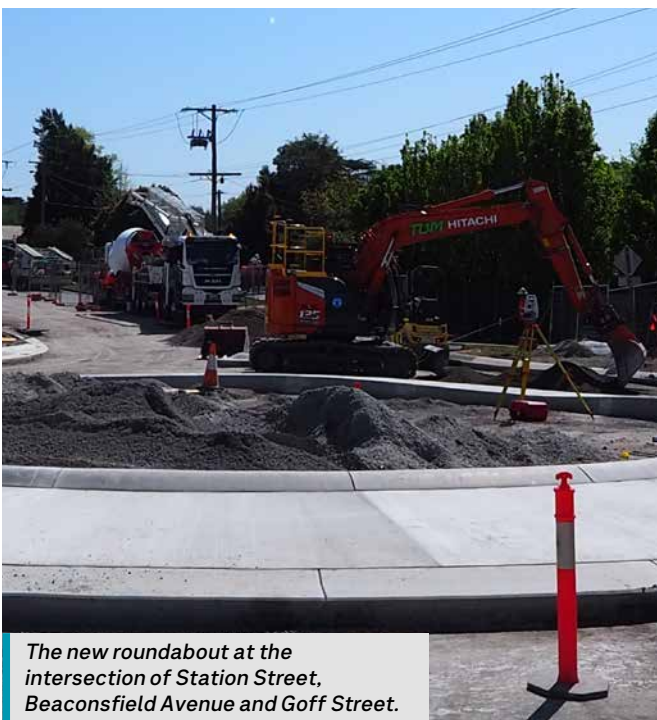
The new roundabout at the intersection of Station Street, Beaconsfield Avenue and Goff Street.