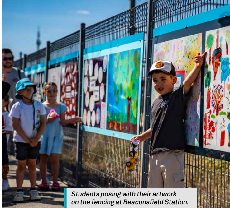
Students posing with their artwork on the fencing at Beaconsfield Station.