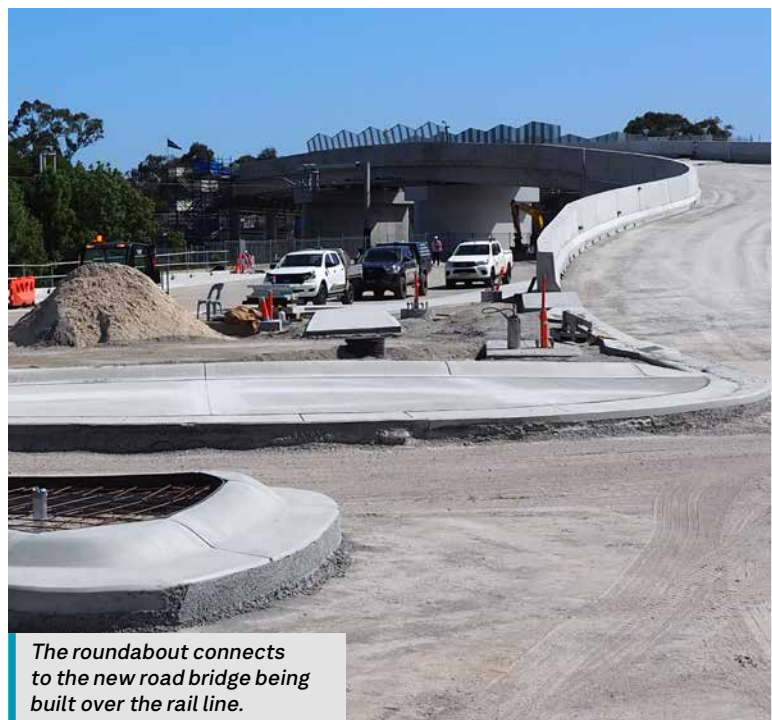
The roundabout connects to the new road bridge being built over the rail line.