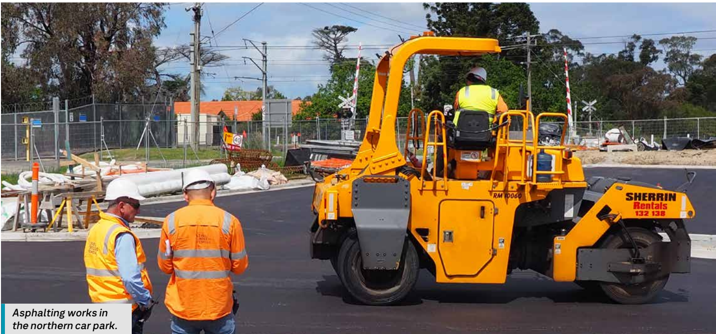
Asphalting works in the northern car park.

Thank you Beaconsfield locals for your patience whilst we completed these works.