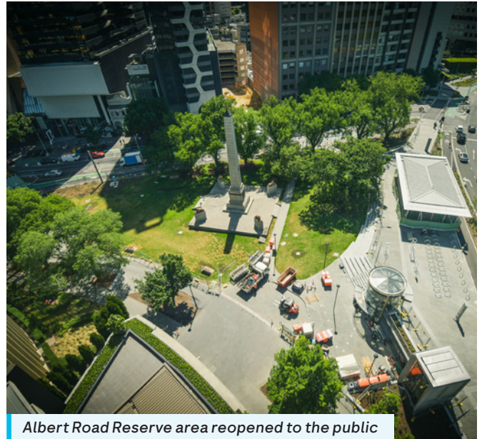
Albert Road Reserve area reopened to the public

24 hour works are sometimes required during peak construction activities