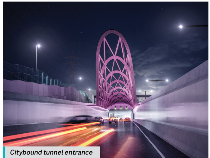
Citybound tunnel entrance

westgatetunnelproject.vic.gov.au/nameyourtunnels