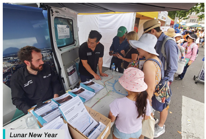
Lunar New Year

During March we were also at a number of major events across the state including at the F1 Grand Prix and the Australian International Air Show.