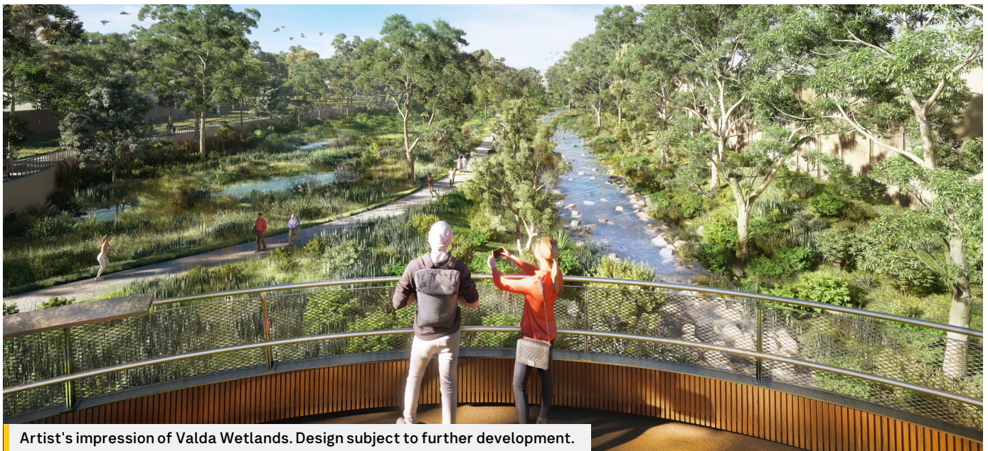
Artist's impression of Valda Wetlands. Design subject to further development.

Schedule is subject to change. Visit bigbuild.vic.gov.au/roads for schedule changes.