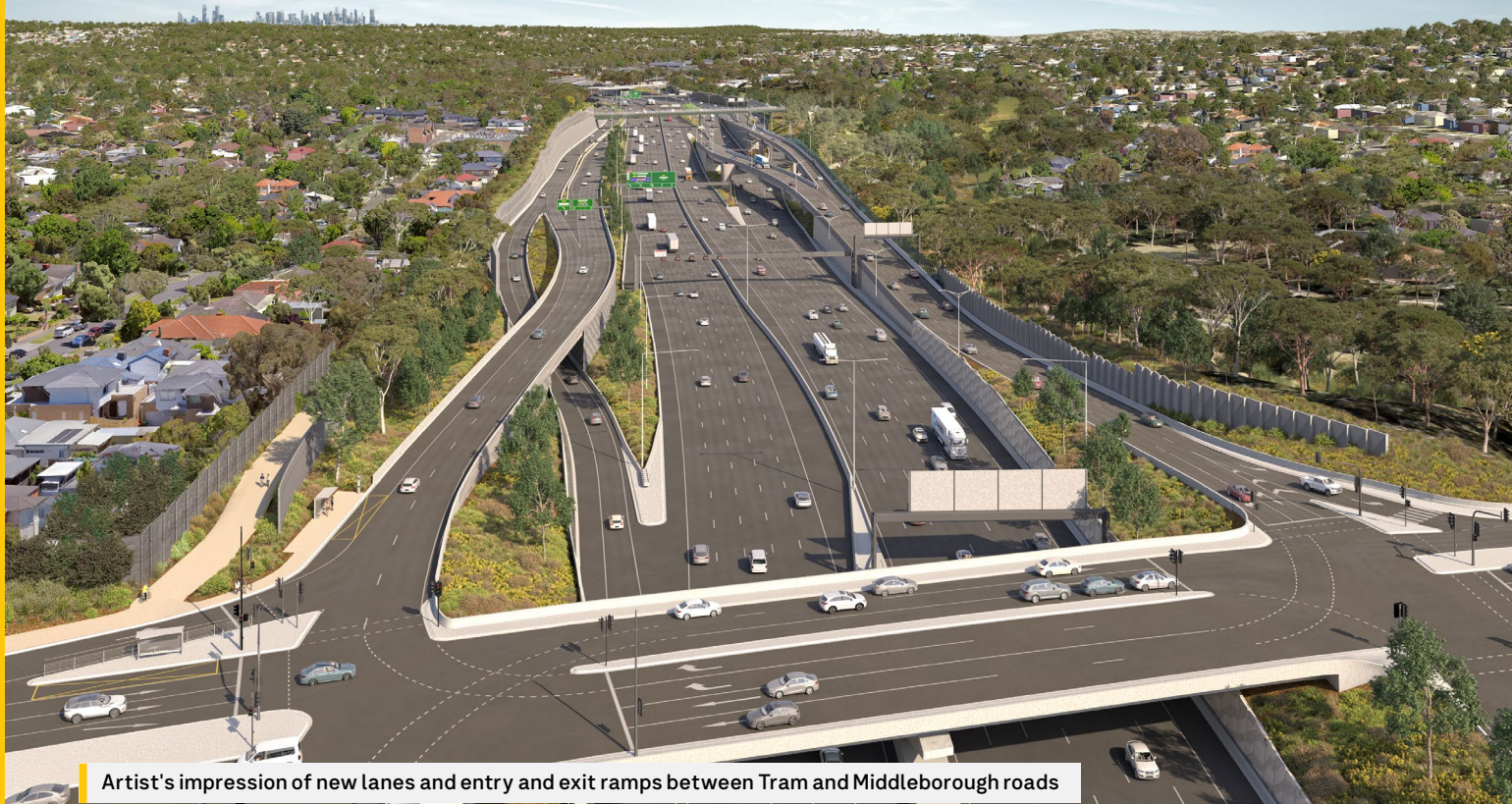
Artist's impression of new lanes and entry and exit ramps between Tram and Middleborough roads