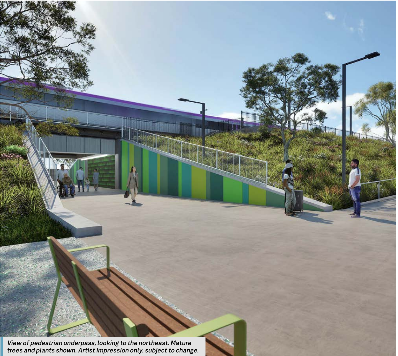
View of pedestrian underpass, looking to the northeast. Mature trees and plants shown. Artist impression only, subject to change.