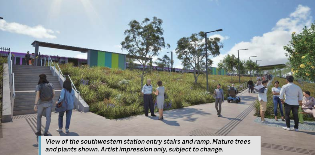
View of the southwestern station entry stairs and ramp. Mature trees and plants shown. Artist impression only, subject to change.