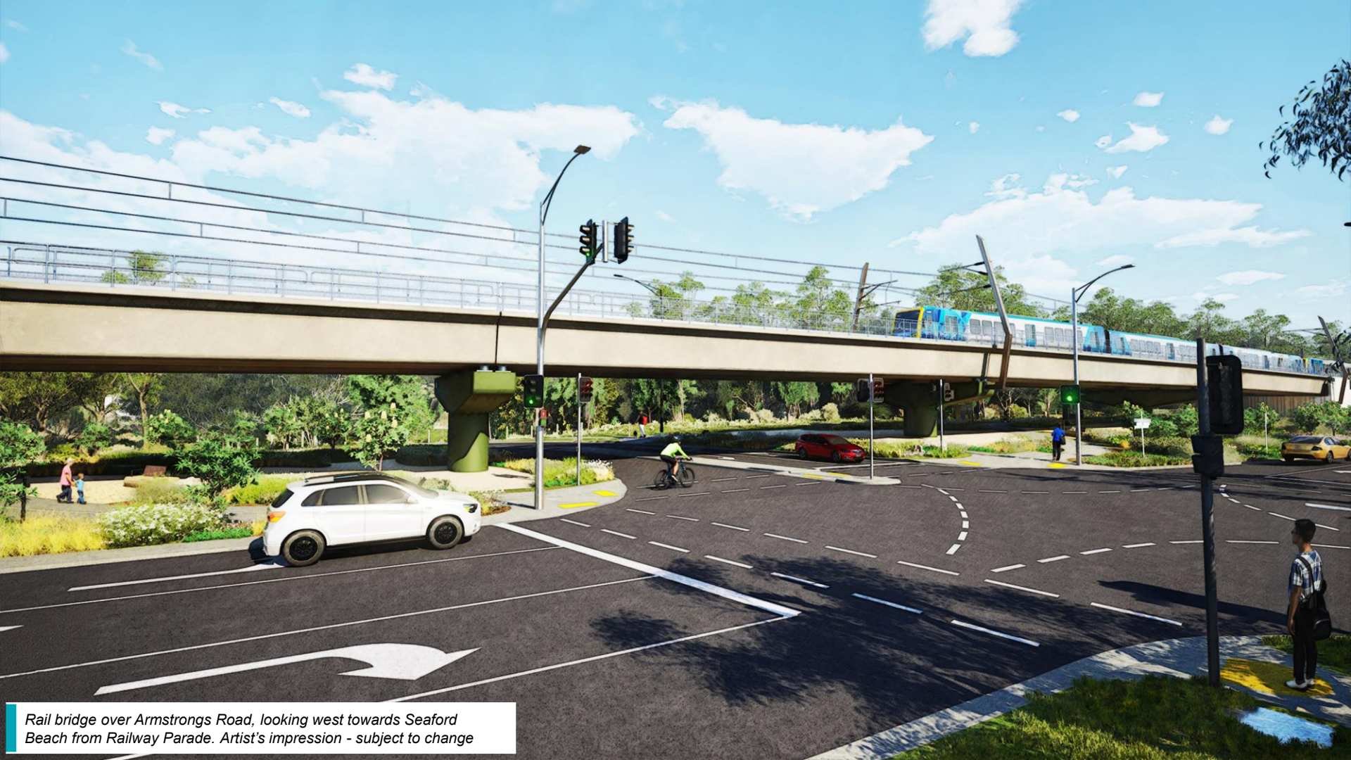
Rail bridge over Armstrongs Road, looking west towards Seaford Beach from Railway Parade. Artist's impression - subject to change