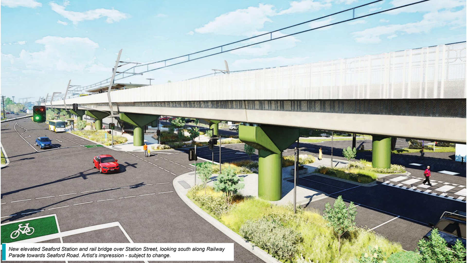
New elevated Seaford Station and rail bridge over Station Street, looking south along Railway Parade towards Seaford Road. Artist's impression - subject to change.