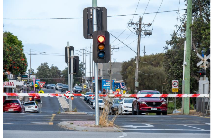
Boom gates down at the Station Street level crossing

Seven near misses near misses at these crossings since 2016.