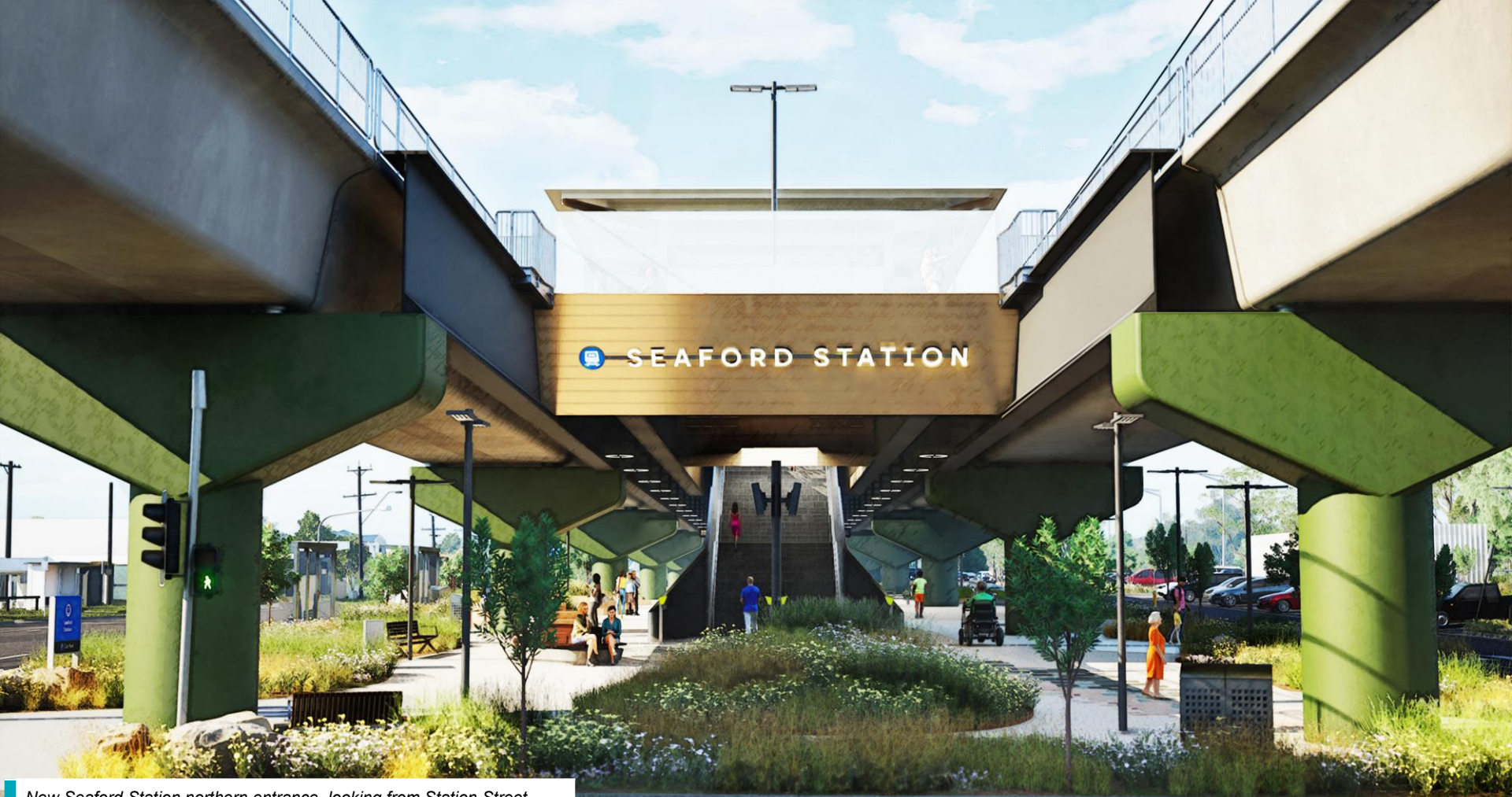
New Seaford Station northern entrance, looking from Station Street. Artist's impression - subject to change.