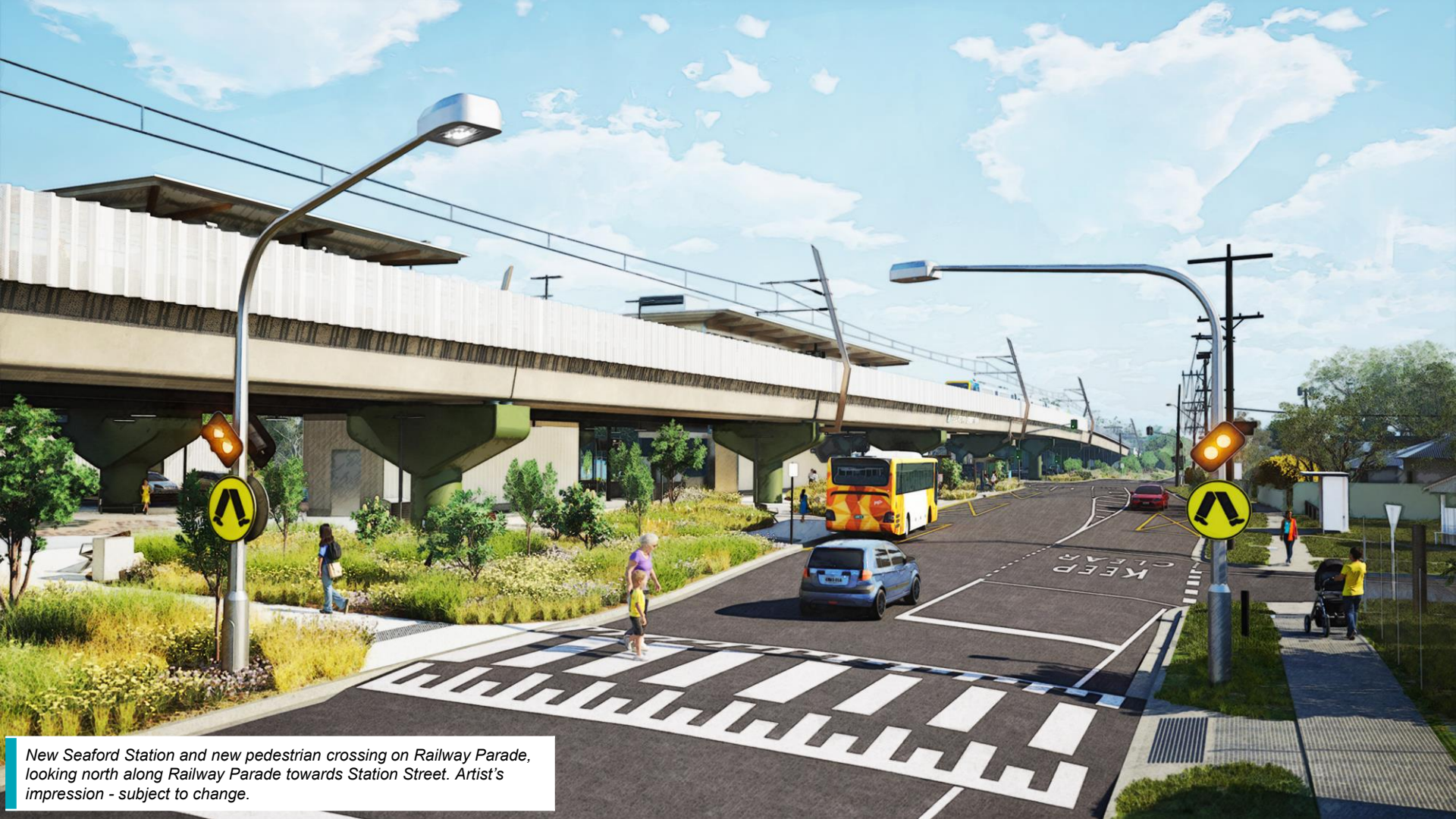
New Seaford Station and new pedestrian crossing on Railway Parade, looking north along Railway Parade towards Station Street. Artist's impression - subject to change.