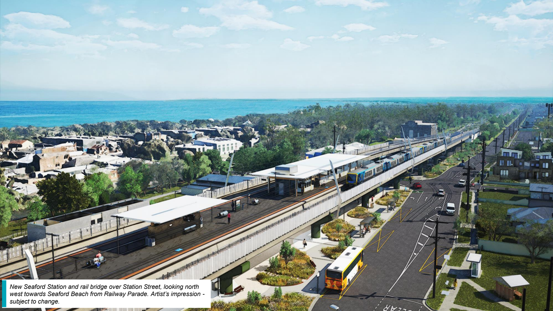
New Seaford Station and rail bridge over Station Street, looking north west towards Seaford Beach from Railway Parade. Artist's impression - subject to change.