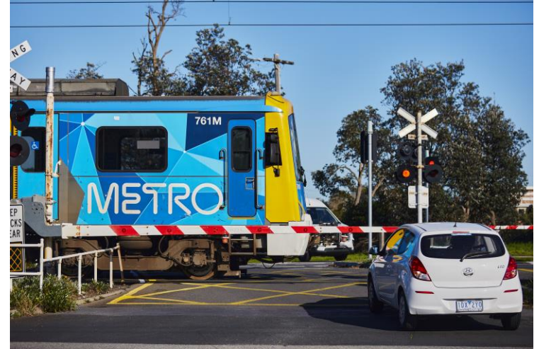
Boom gates down at the Armstrongs Road level crossing