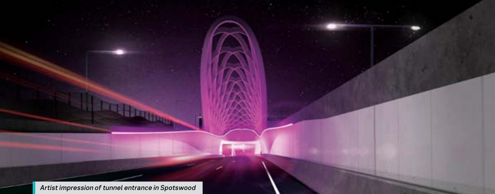
Artist impression of tunnel entrance in Spotswood