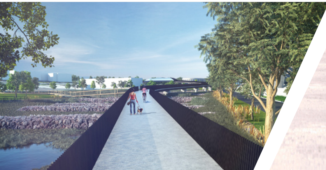
New boardwalk and wetlands, Footscray

In the coming weeks we'll be out and about in your community so you can come and see the design and ask questions ahead of the Environment Effects Statement being released in mid-2017.