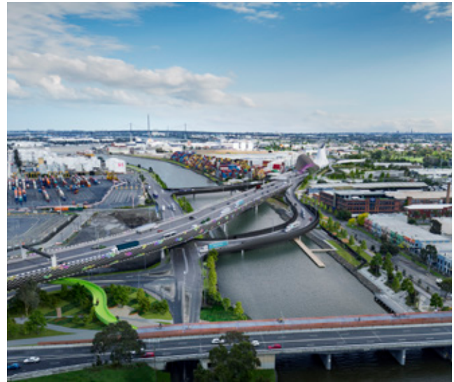
New bridge over the Maribyrnong River and MacKenzie Road ramps Artist impression only - does not include detailed design