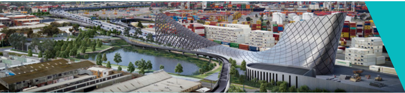
Northern tunnel portal, Footscray