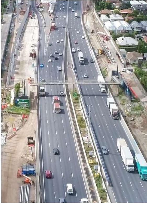
Before – old pedestrian bridge