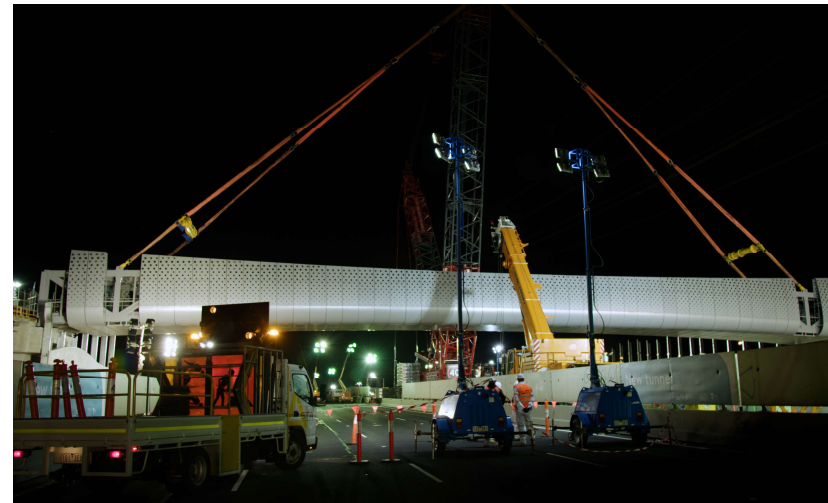
Installation of truss overnight