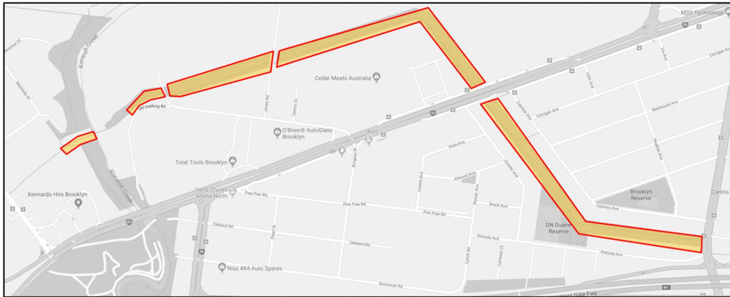
Section of Federation Trail being upgraded in early 2021