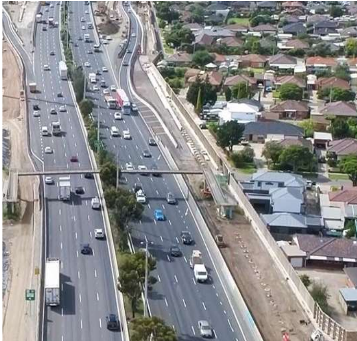
Before – Old pedestrian bridge