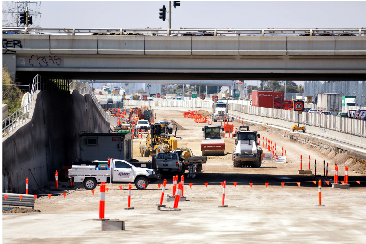
Freeway widening works