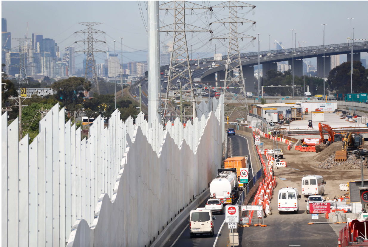
New noise walls along freeway – Williamstown inbound exit ramp