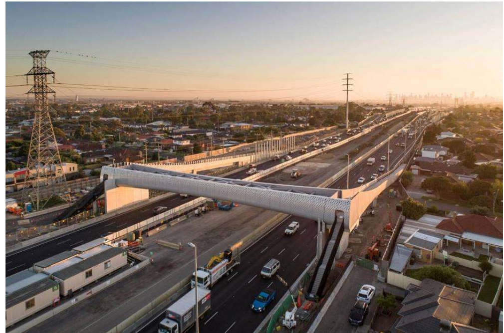
After – New walking and cycling overpass