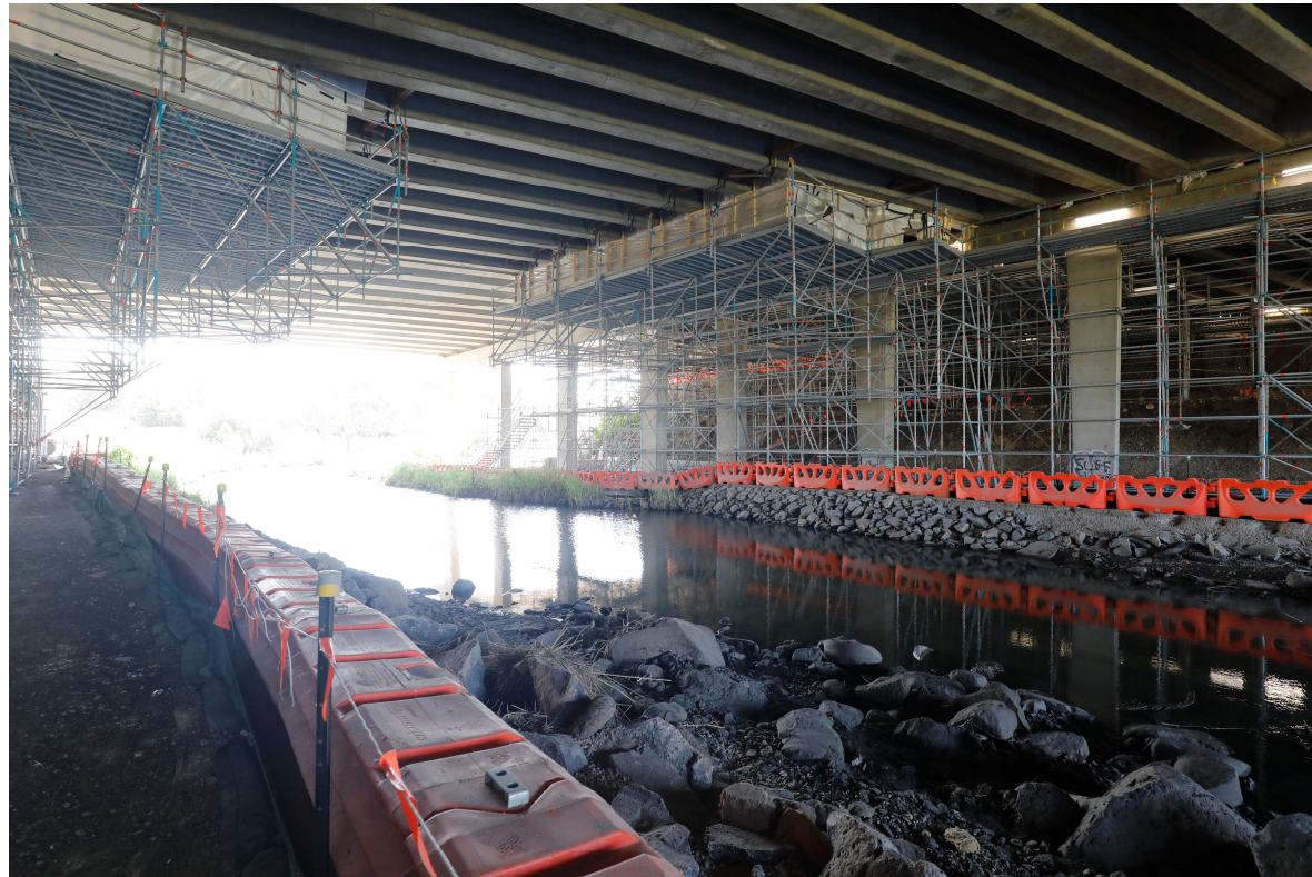
Bridge strengthening works