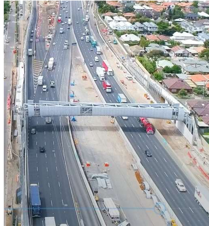
After – new walking and cycling overpass