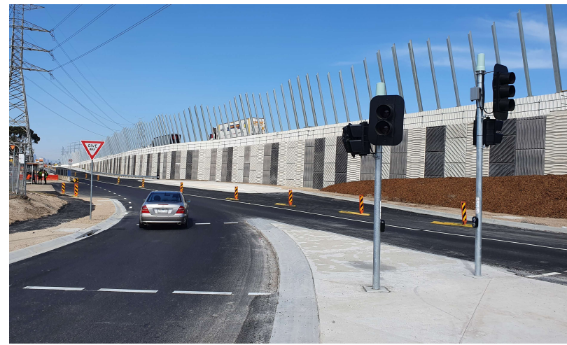
After – Millers Road inbound entry ramp