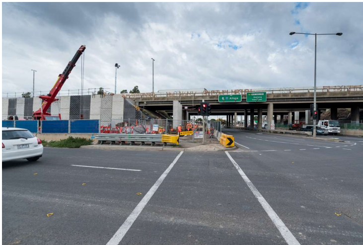
Before – Millers Road inbound entry ramp