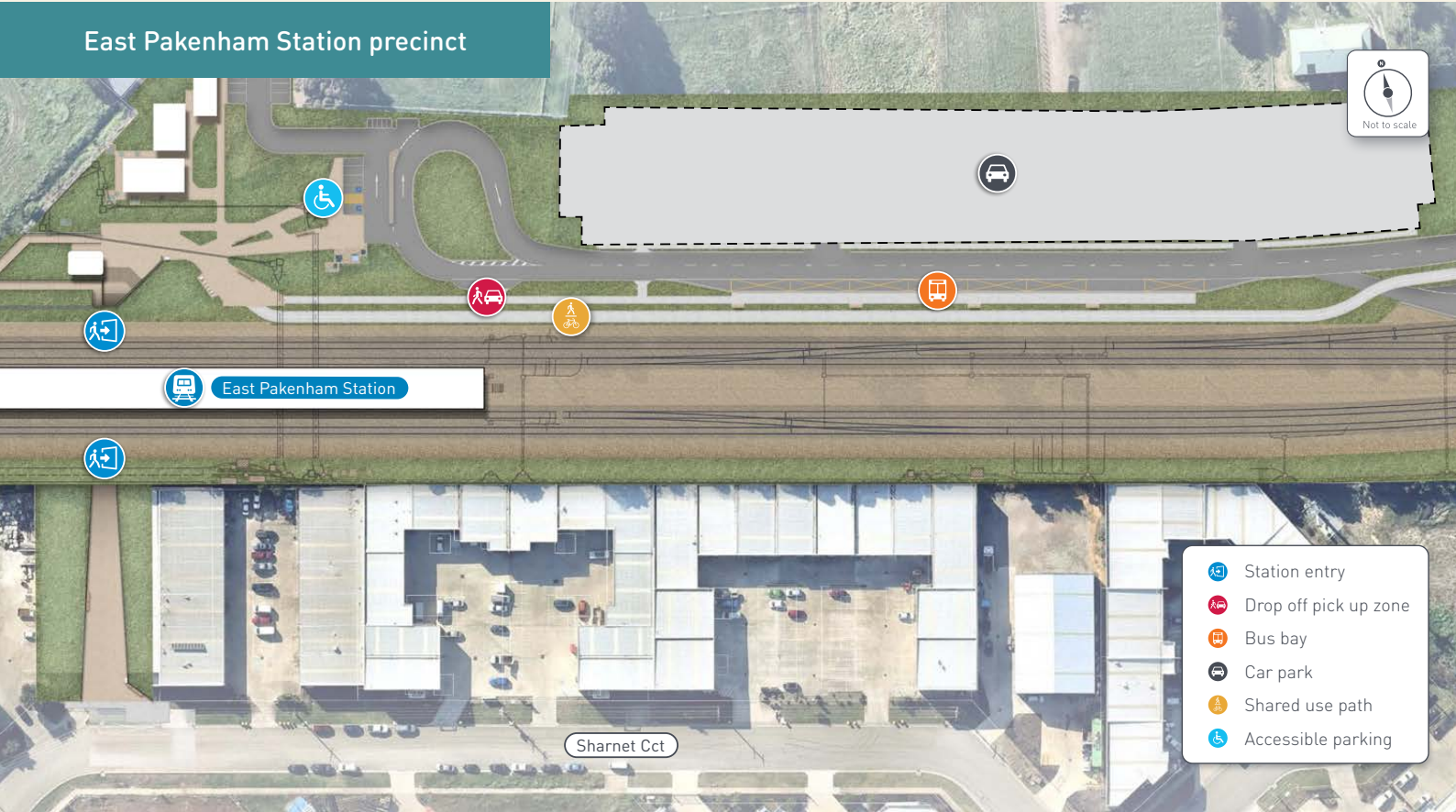
Not to scale.

The East Pakenham Station will feature a Protective Services Officer (PSO) office and will have a staff presence seven days a week. There will also be CCTV cameras on platforms and station entrances, clear sightlines, and open and well-lit areas.