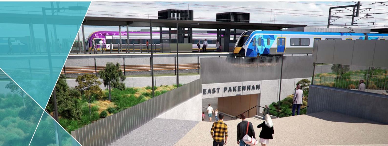
View of new East Pakenham Station entrance, looking south. Artist impression – subject to change.

We're removing the dangerous and congested level crossings at McGregor Road, Main Street and Racecourse Road by building a rail bridge over the roads and building new stations at Pakenham and East Pakenham.