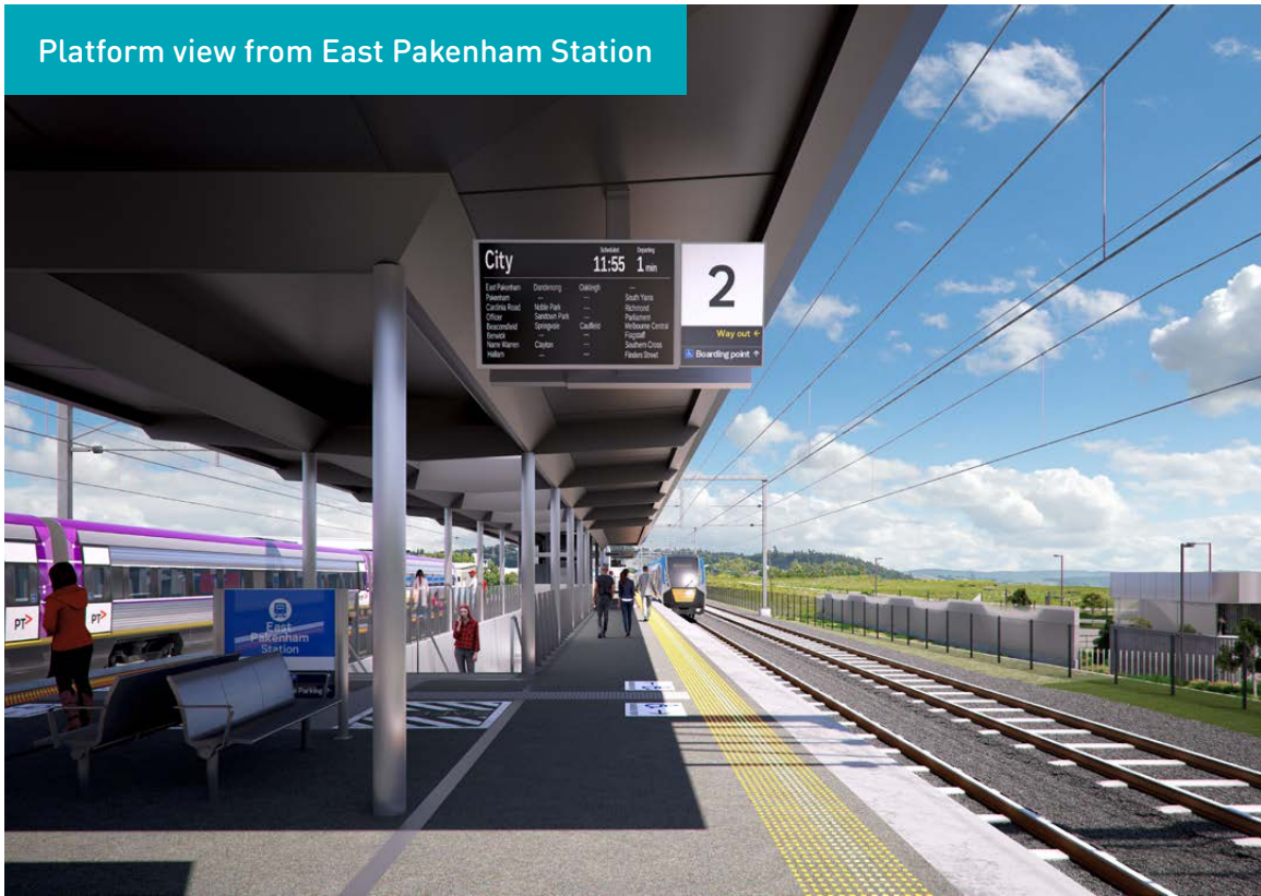
Artist impression – subject to change.