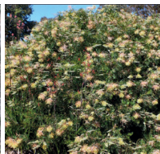
Peaches and cream