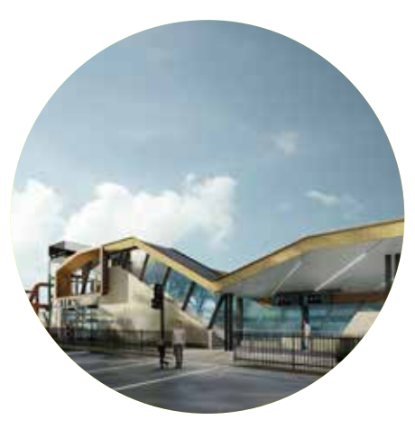
Artist impression only. Subject to change.