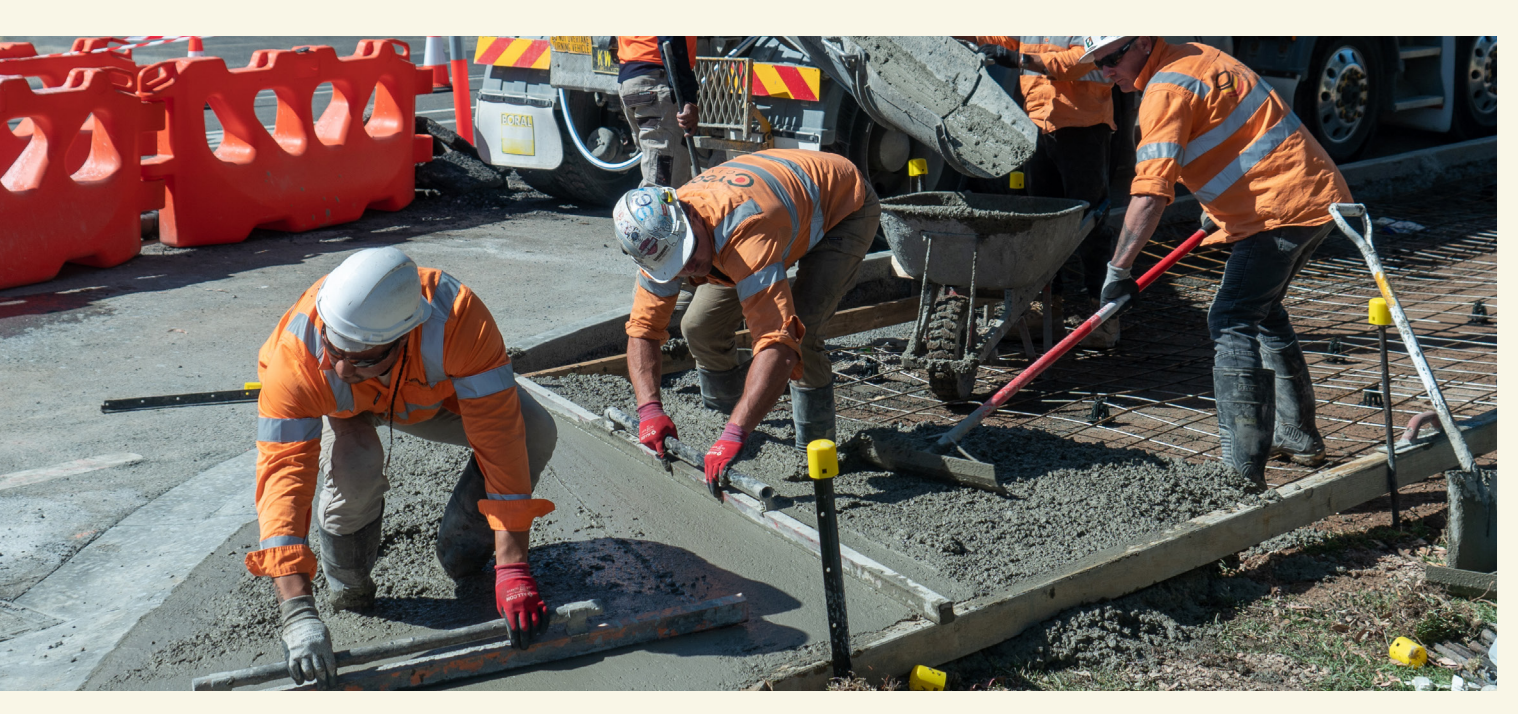
Crews lay foundations for new bus stop

Works are also underway to construct a temporary signalised pedestrian crossing, ensuring passenger safety while the new rail bridge and station are being built.