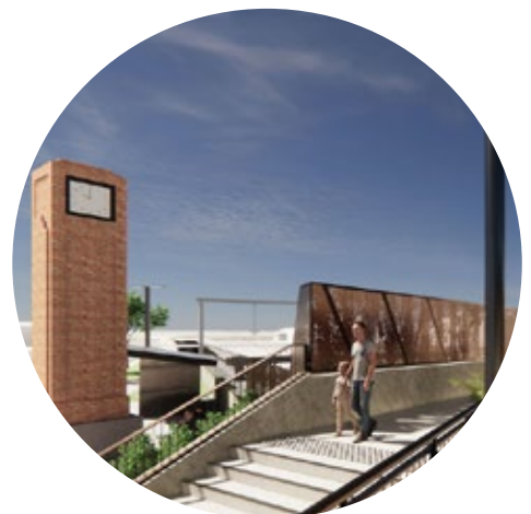
The Chelsea clock tower and new Chelsea pedestrian bridge. Artist impression – subject to change.

Together, with the new Chelsea Station markers and woven canopies which reference the textiles and craft of the traditional owners of the land, the area will reflect Chelsea's rich and vibrant history.