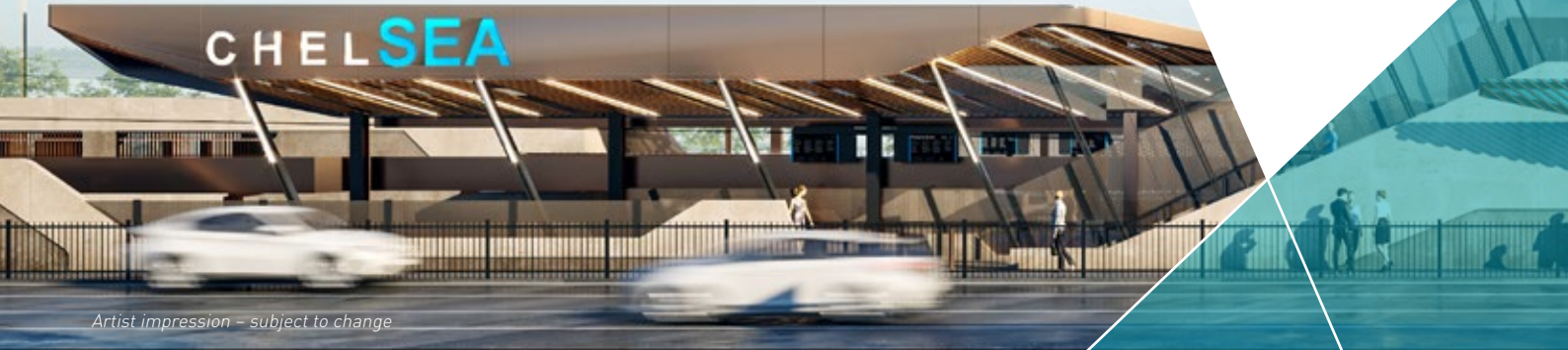
Artist impression – subject to change