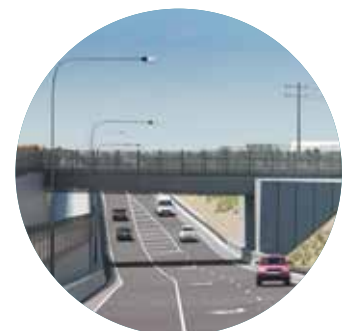
Artist's impression - subject to change