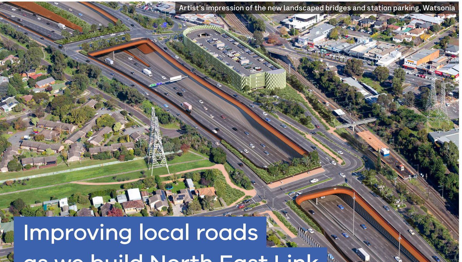
Artist's impression of the new landscaped bridges and station parking, Watsonia