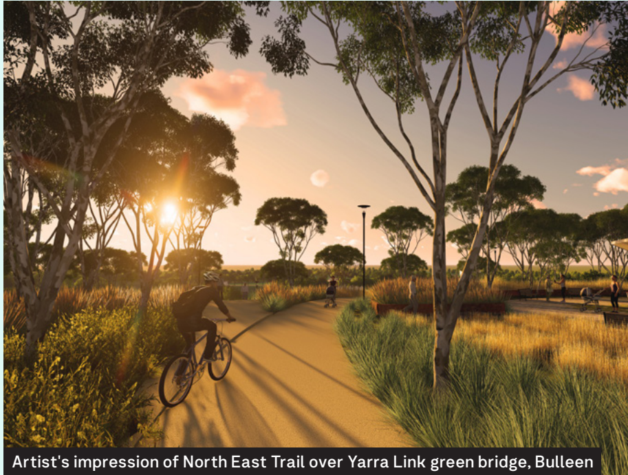
Artist's impression of North East Trail over Yarra Link green bridge, Bulleen