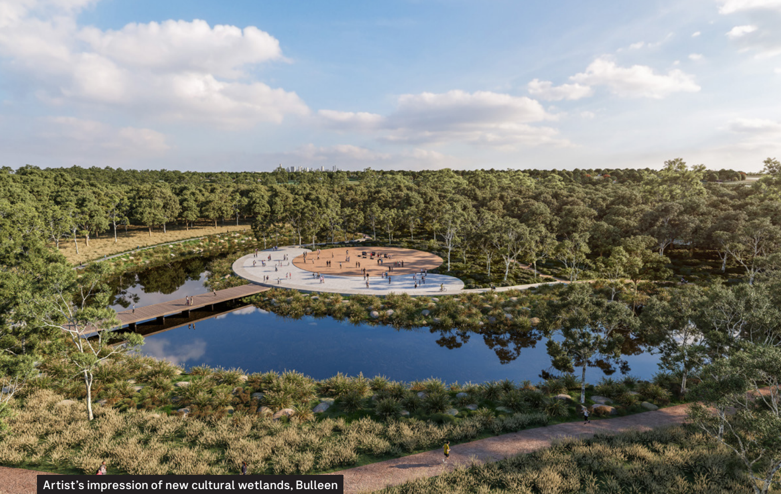
Artist's impression of new cultural wetlands, Bulleen

The North East Link Tunnels will take traffic and trucks under instead of through our suburbs and give local roads back to local people. We're also creating new wetlands and parklands, better connecting Koonung Creek and Yarra River trails and delivering a major upgrade of the Eastern Freeway.