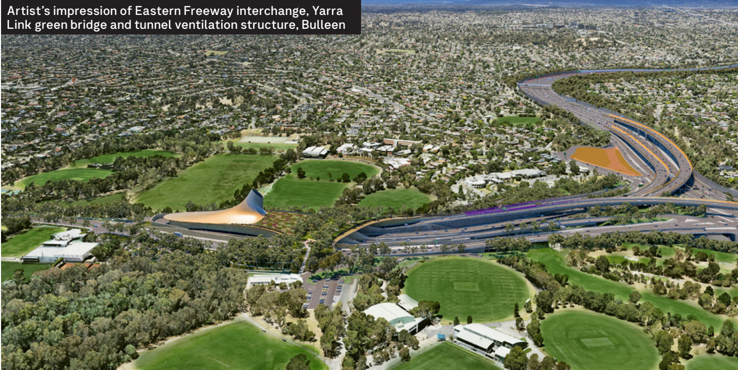
Artist's impression of Eastern Freeway interchange, Yarra Link green bridge and tunnel ventilation structure, Bulleen

The design is inspired by traditional Wurundjeri eel traps. Solar panels will help power the tunnels below.