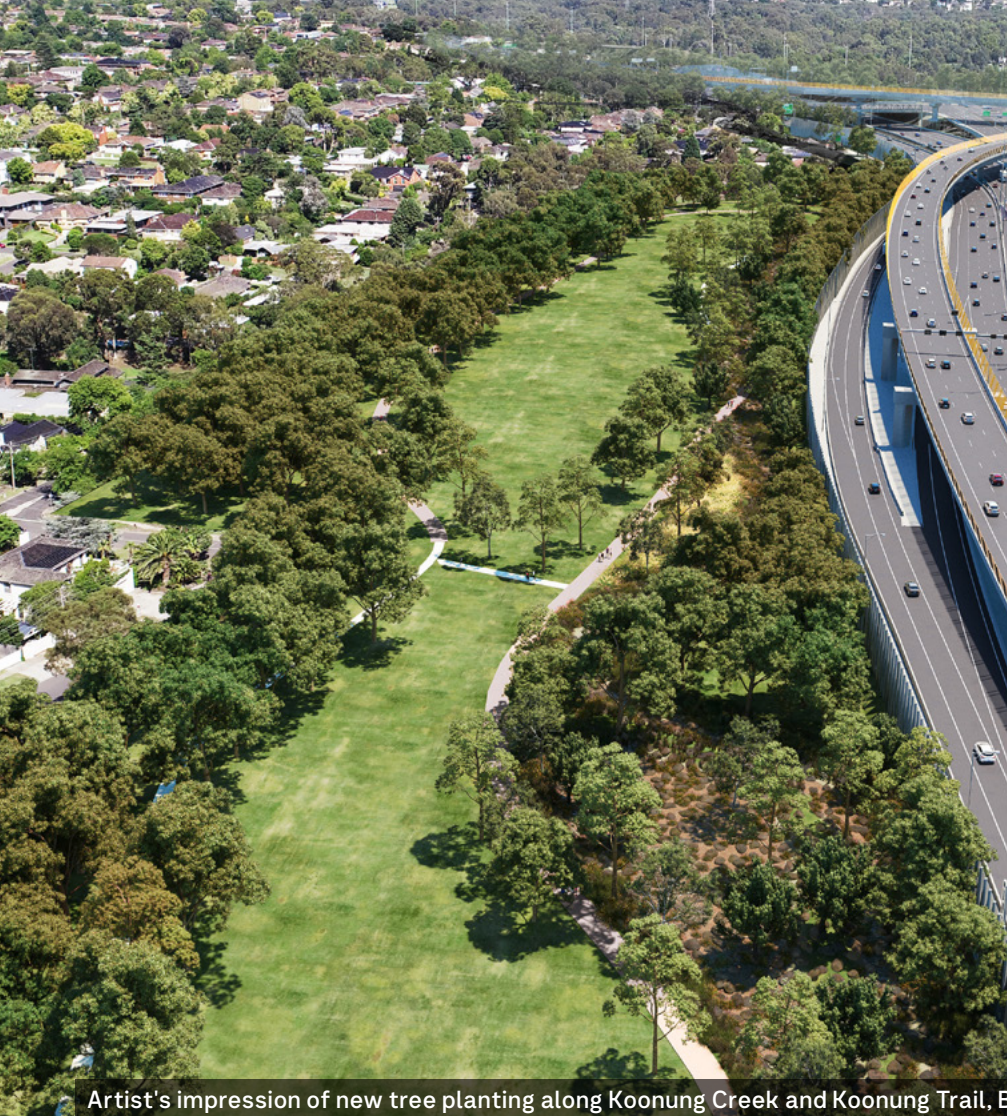
Artist's impression of new tree planting along Koonung Creek and Koonung Trail, Balwyn North