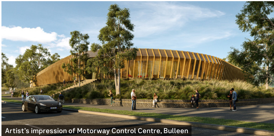
Artist's impression of Motorway Control Centre, Bulleen

The Eastern Express Busway from Doncaster towards the city is Melbourne's first dedicated busway. High-speed bus lanes will pass under the Eastern Freeway interchange ramps at up to 100km an hour. Work to build the new Bulleen Park & Ride is underway now.