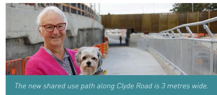
The new shared use path along Clyde Road is 3 metres wide.