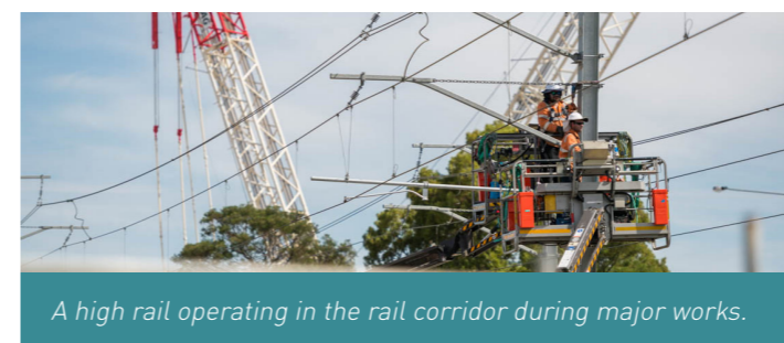
A high rail operating in the rail corridor during major works.