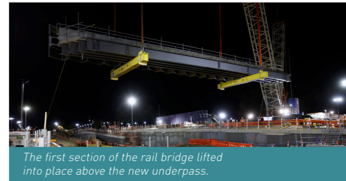
The first section of the rail bridge lifted into place above the new underpass.

95 PIECES OF MOBILE PLANT USED EXCLUDING TRUCKS