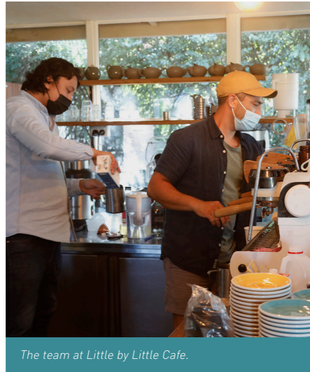
The team at Little by Little Cafe.

See the full menu or make a booking at the cafe, which serves Five Senses Coffee, at littlebylittlecafe.com