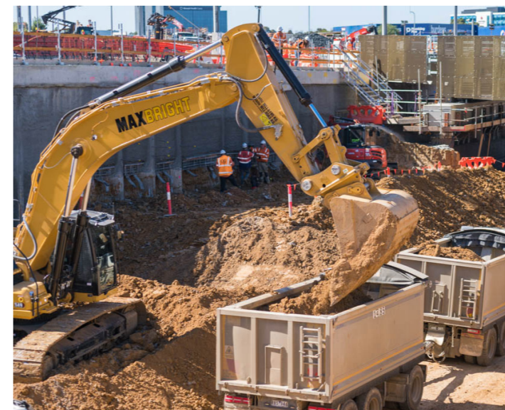
We excavated around 40,000 cubic metres of material to build the road underpass.