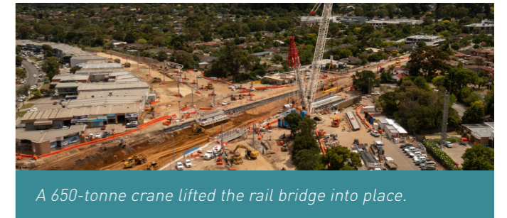
A 650-tonne crane lifted the rail bridge into place.