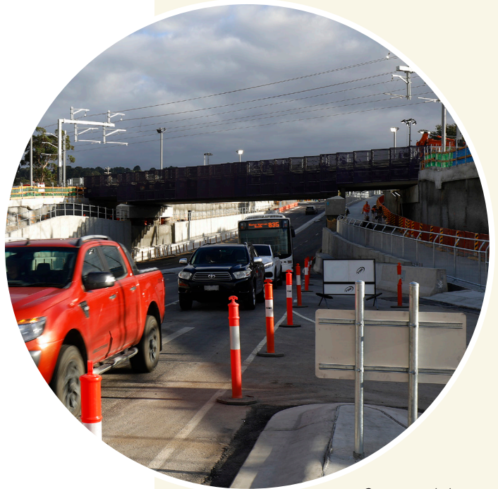
Cars used the new underpass for the first time in February.