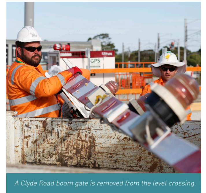
A Clyde Road boom gate is removed from the level crossing.