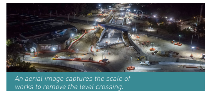
An aerial image captures the scale of works to remove the level crossing.