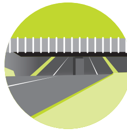
4 lowering the road under the rail line