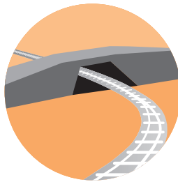
2 building a road bridge over the rail line