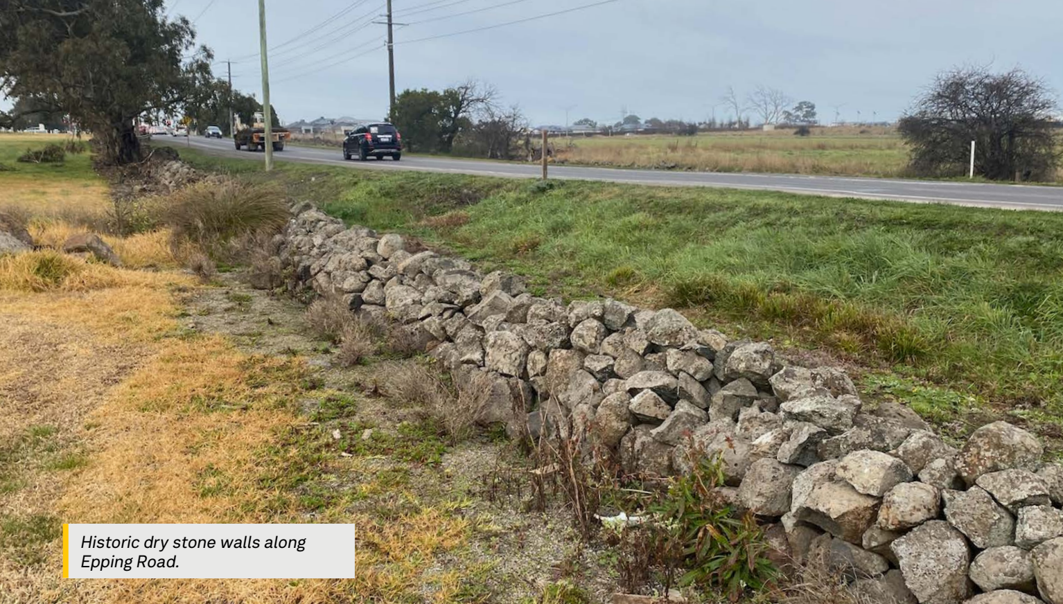
Historic dry stone walls along Epping Road.