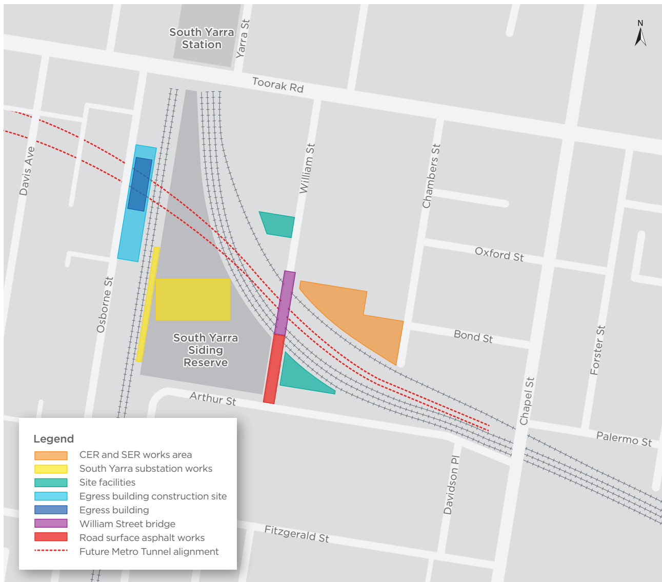
South Yarra construction works – Indicative only