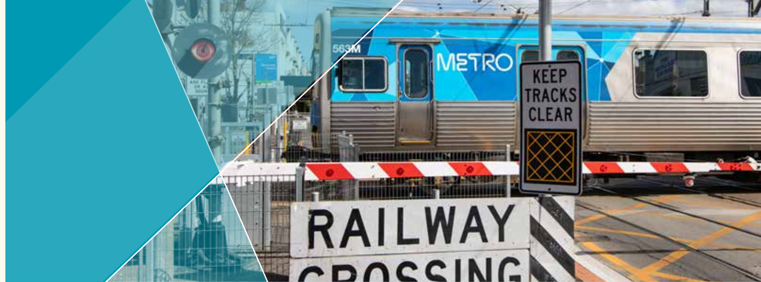
Glen Huntly Road level crossing