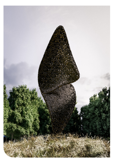
Artist impression of the new Montmorency Station by Melbourne based sculptor, Robert Bridgewater. Subject to change.

The sculpture draws inspiration from the native Eltham Copper Butterfly, a small butterfly with bright orange-yellow or copper colouring on the tops of its wings. The Eltham Copper Butterfly was not seen in the Montmorency area for more than 40 years before being spotted in January 2021. Significant measures were taken to protect the butterfly during construction of the Hurstbridge Line Duplication.