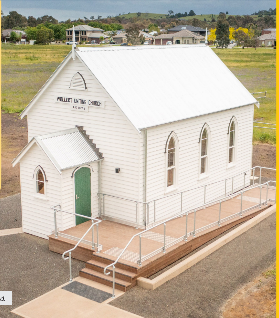
Wollert church was relocated and restored.

Legacy projects work collectively with local communities to reimagine and reinvent spaces that strengthen the connection between people and place.