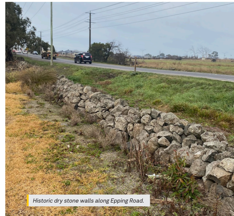
Historic dry stone walls along Epping Road.

As part of the upgrade, we will build dedicated right turns and U-turns bays to help you get where you need to be.