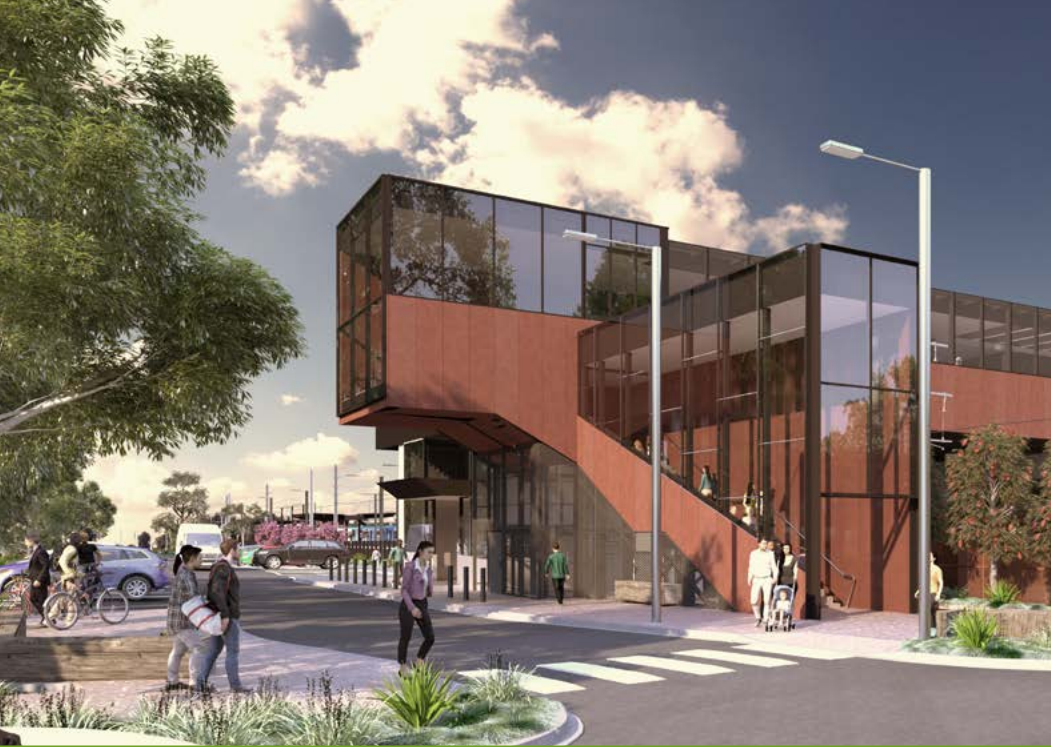
Stairs and lifts at the new Greensborough Station – view from Poulter Avenue (Hurstbridge bound). Artist impression only – subject to change.