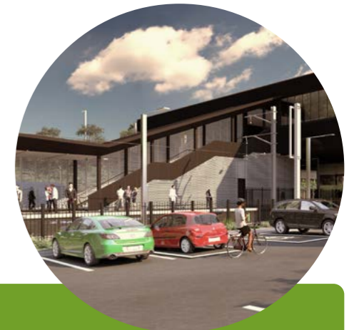
New Greensborough Station - view from Poulter Avenue. Artist impression only - subject to change