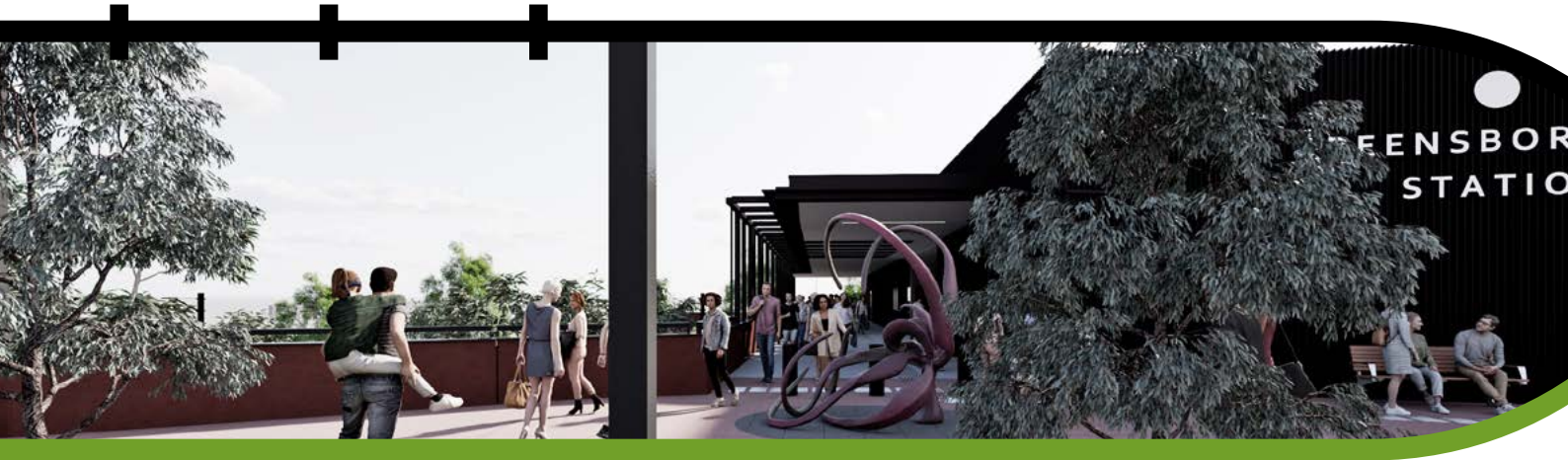
New Greensborough Station and concourse – view from Para Road. Artist impression only – subject to change