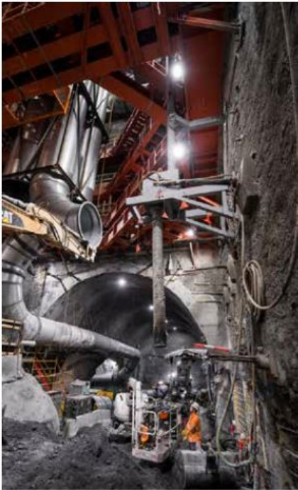
Close-up view of the TBM cutterhead, showing the intricate mechanical details.