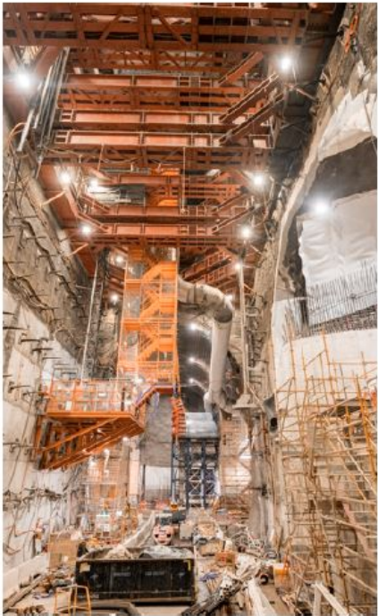
Interior view of the tunnel construction site, showing the extensive scaffolding and structural elements.