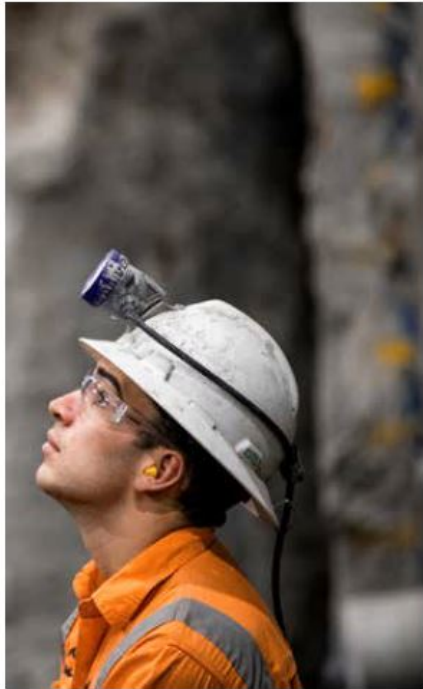
Construction worker wearing a hard hat and safety glasses, looking upwards.