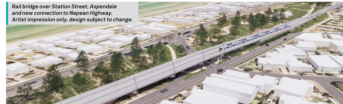
Rail bridge over Station Street, Aspendale and new connection to Nepean Highway. Artist impression only, design subject to change.

This will include site investigations in collaboration with the RAP, and assessing how impacts to Aboriginal places can be avoided, minimised or mitigated.