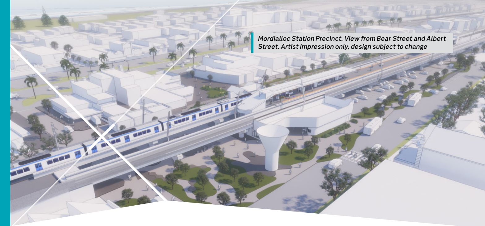
Mordialloc Station Precinct. View from Bear Street and Albert Street. Artist impression only, design subject to change

Consultation is now open, providing you with an opportunity to formally submit your feedback. Planning submissions can be made online at engage.vic.gov.au/lxrp-mordialloc-and-aspendale