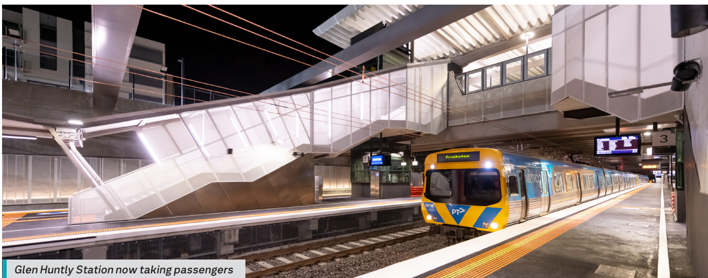
Glen Huntly Station now taking passengers