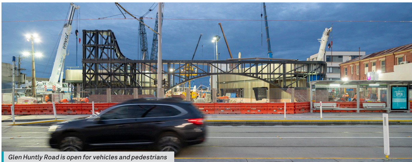
Glen Huntly Road is open for vehicles and pedestrians

For more information on changes and disruptions in your local area, please visit: bigbuild.vic.gov.au/glen-huntly or scan the QR code