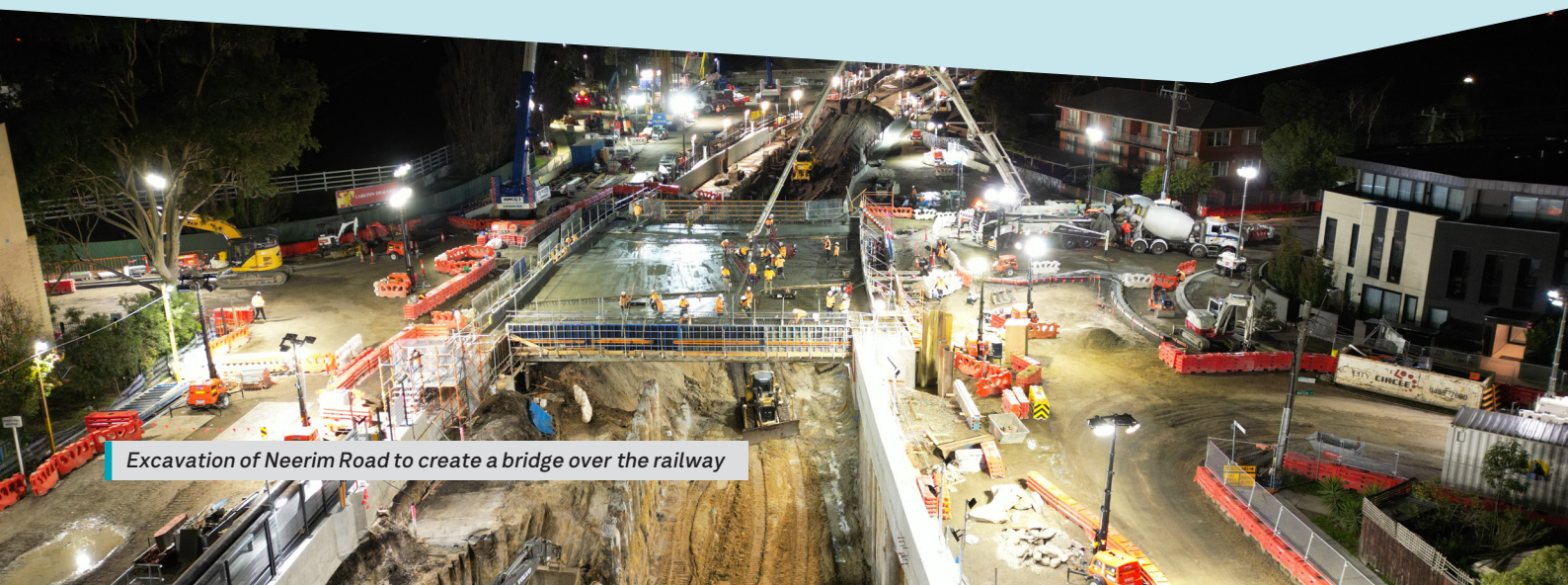
Excavation of Neerim Road to create a bridge over the railway