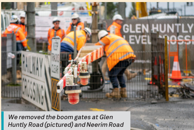
We removed the boom gates at Glen Huntly Road (pictured) and Neerim Road