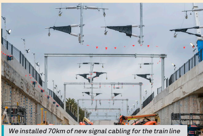
We installed 70km of new signal cabling for the train line