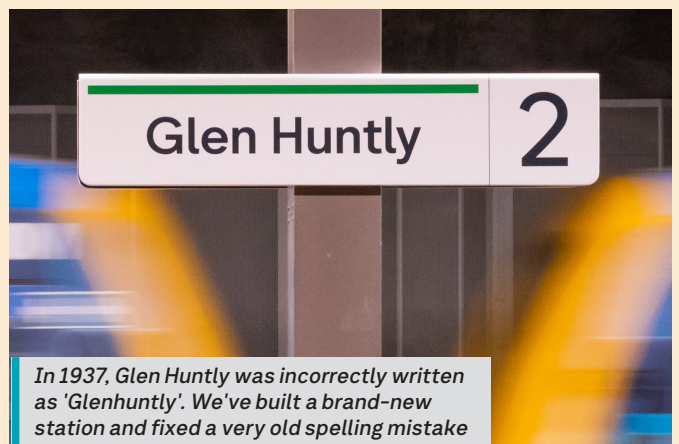
In 1937, Glen Huntly was incorrectly written as 'Glenhuntly'. We've built a brand-new station and fixed a very old spelling mistake