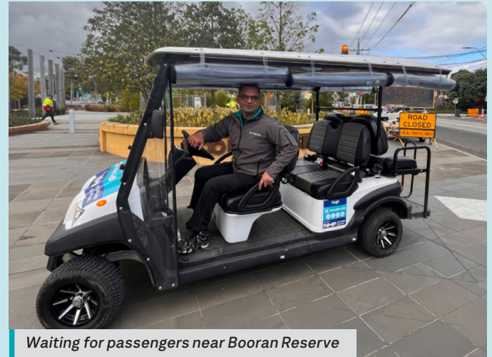
Waiting for passengers near Booran Reserve

The service won a lot of local fans – even local traders would take advantage of the service – with more than 2300 trips made during the works.