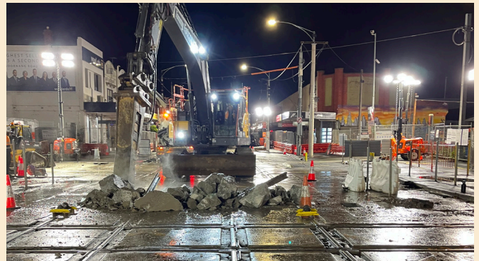
We removed the Glen Huntly tram square: one of only three dangerous tram squares left in Melbourne