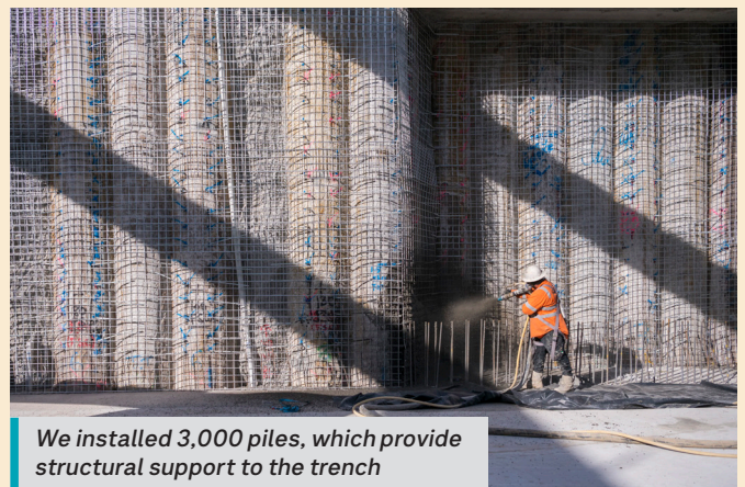
We installed 3,000 piles, which provide structural support to the trench