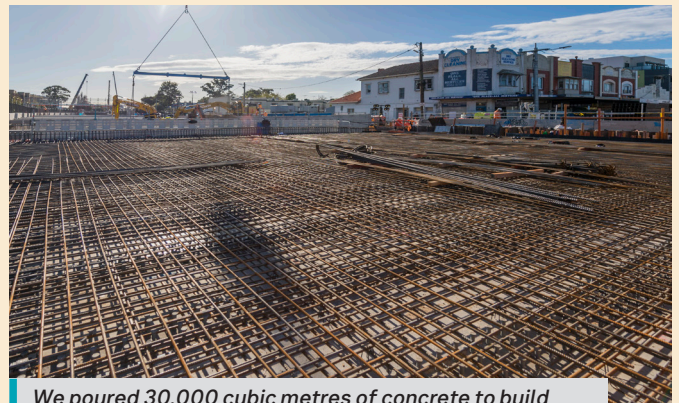
We poured 30,000 cubic metres of concrete to build the trench for the new rail line, and the new road bridges