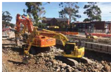
Earthworks and rock breaking to lower the rail line at Main Road

Further trenching works will continue along the rail track, from the M80 Ring Road to Albion Station.