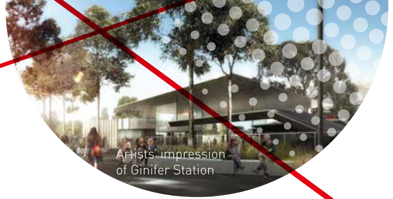
Artists' impression of Ginifer Station