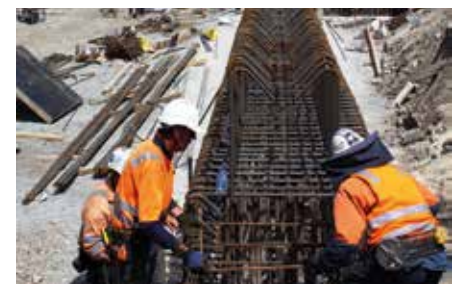
Steel reinforcements being installed at Main Road