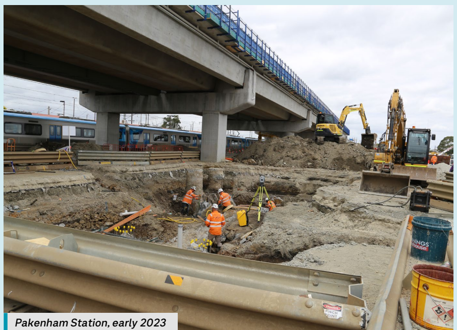
Pakenham Station, early 2023

The team has begun to install the first of the 258 panels that will create a bronzed roof inspired by Pakenham's rolling hills and bronze sunsets.