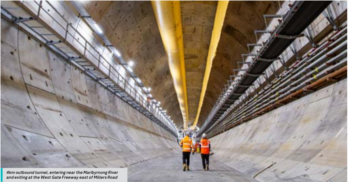
4km outbound tunnel, entering near the Maribyrnong River and exiting at the West Gate Freeway east of Millers Road