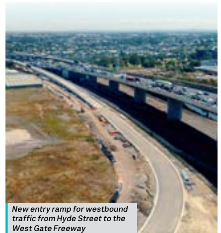
New entry ramp for westbound traffic from Hyde Street to the West Gate Freeway

The tunnel and new lanes on the West Gate Freeway, Footscray Road and Wurundjeri Way will open to traffic in late 2025.