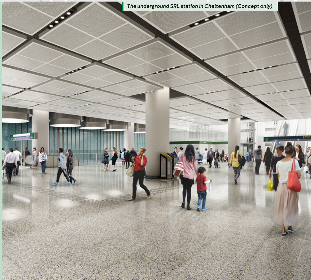
The underground SRL station in Cheltenham (Concept only)

The SRL station will include a fast and easy connection to the existing Southland Station and passengers will not have to touch on and off. Trains will be taking passengers by 2035.