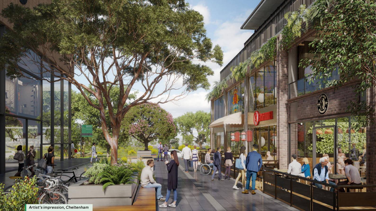
Artist's impression, Cheltenham