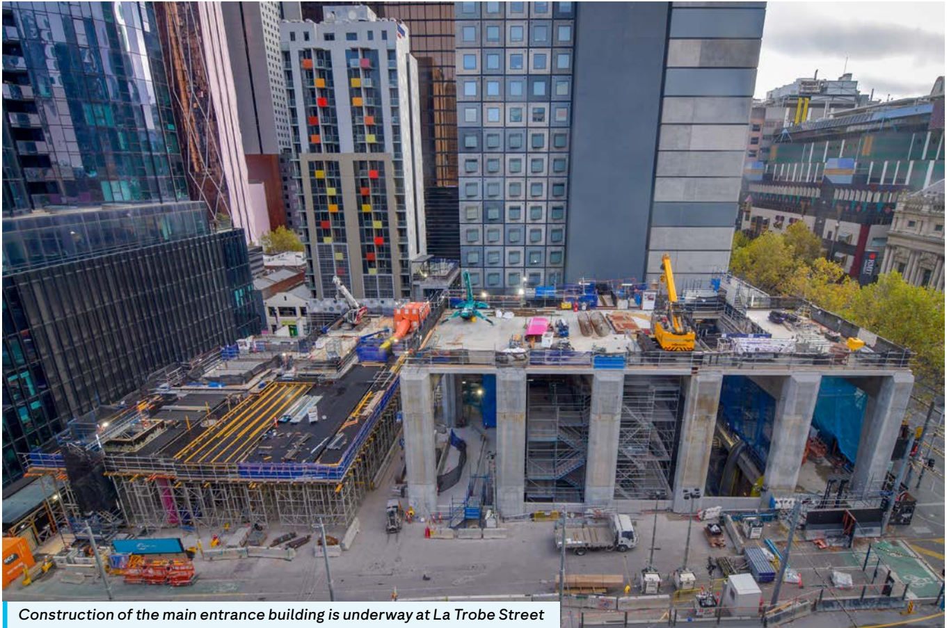
Construction of the main entrance building is underway at La Trobe Street