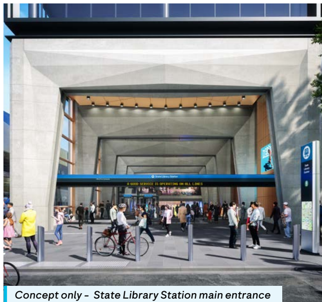
Concept only - State Library Station main entrance

24 hour works are sometimes required during peak construction activities