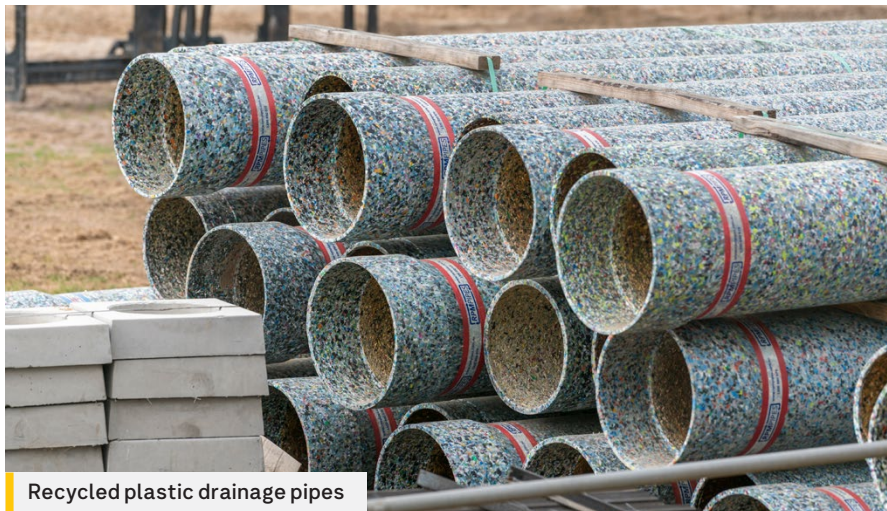
Recycled plastic drainage pipes