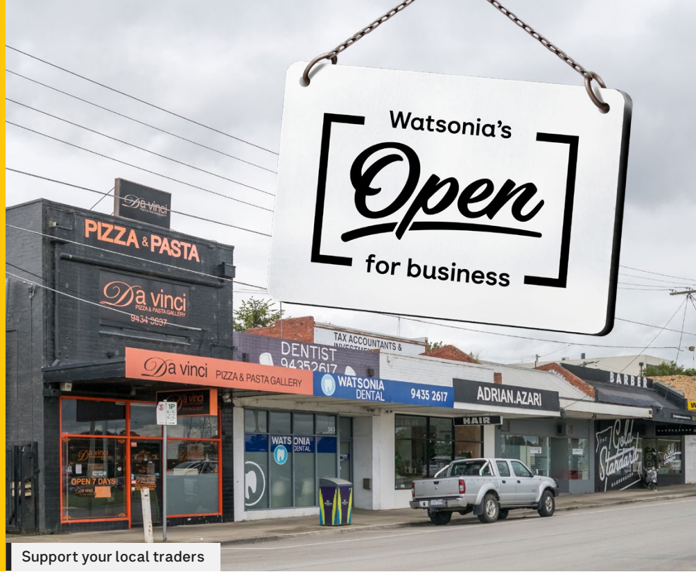
Support your local traders