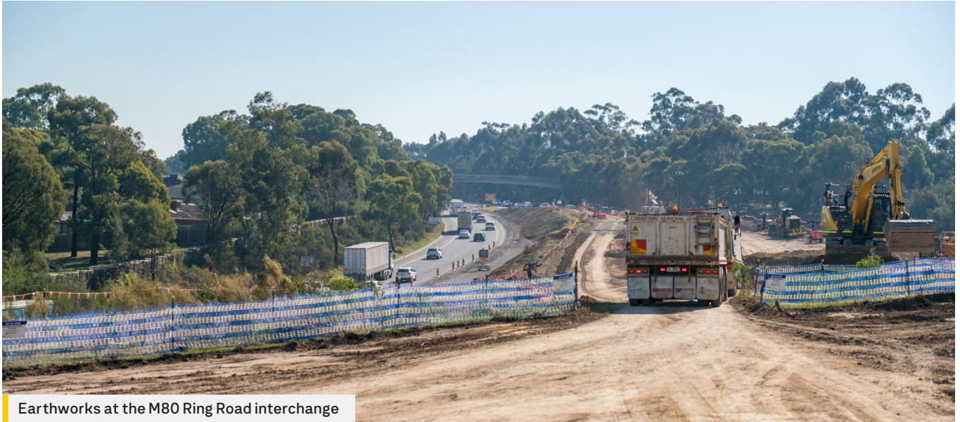
Earthworks at the M80 Ring Road interchange