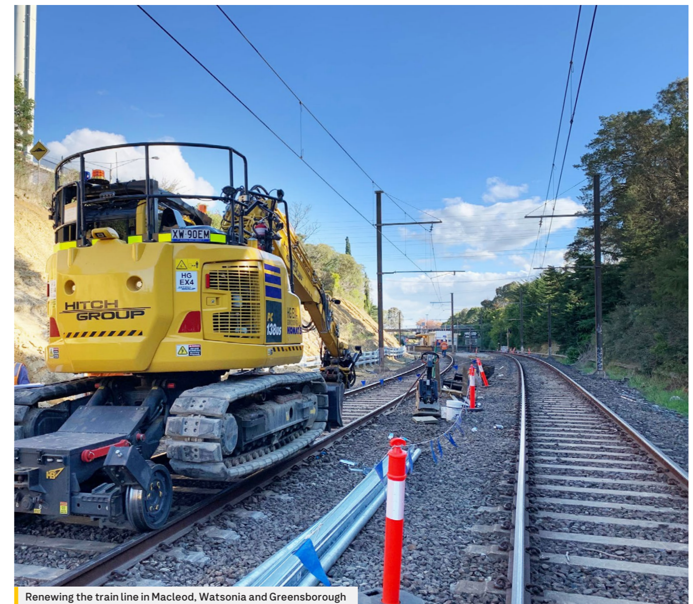
Renewing the train line in Macleod, Watsonia and Greensborough

Traffic conditions will be changing, so please follow all signage and directions from traffic controllers.