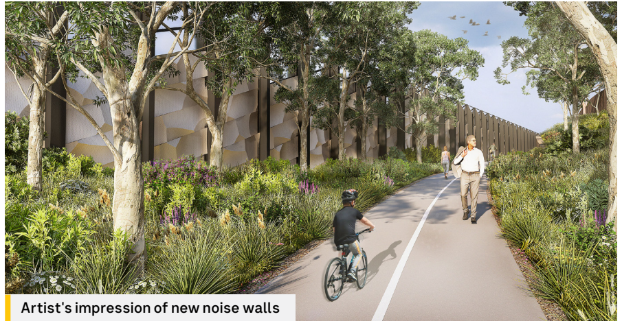
Artist's impression of new noise walls

From October we'll start setting up our work area south of the freeway between Doncaster Road and Valda Wetlands. We'll create space to build the new freeway lanes, upgrade noise walls and divert the Koonung Creek.