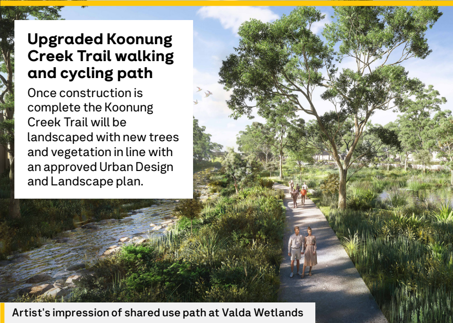
Artist's impression of shared use path at Valda Wetlands

Once construction is complete the Koonung Creek Trail will be landscaped with new trees and vegetation in line with an approved Urban Design and Landscape plan.