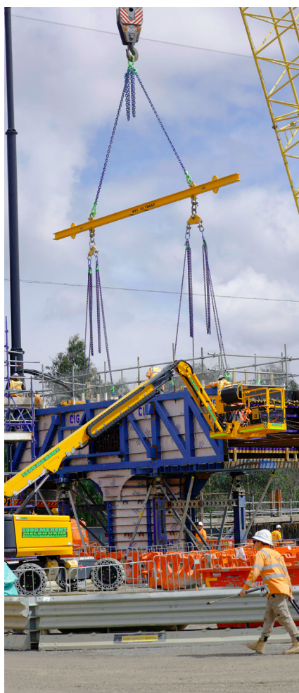
Foundations, piers and crossheads installed, ready for the arrival of Super T's

Super T's are large pre-fabricated concrete beams. They will be installed onto concrete columns and crossheads and will provide support for the elevated roadway.