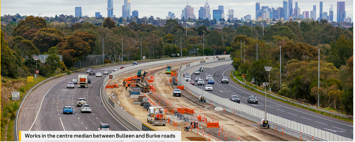
Works in the centre median between Bulleen and Burke roads