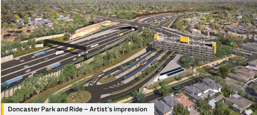
Doncaster Park and Ride – Artist's impression

To see the revised timetable and to plan your journey, visit ptv.vic.gov.au