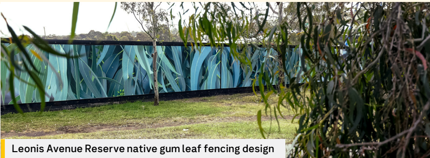
Leonis Avenue Reserve native gum leaf fencing design

At Valda Wetlands, we've installed a timeline design to showcase the changing landscape of the Eastern Freeway over the years and how we're building a reimagined Valda Wetlands precinct with new and upgraded walking and cycling paths.