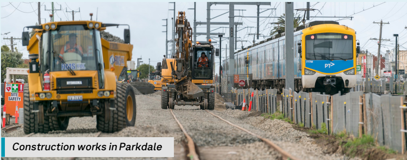
Construction works in Parkdale

We'll provide more information about impacts and disruptions before our works so you can plan ahead.