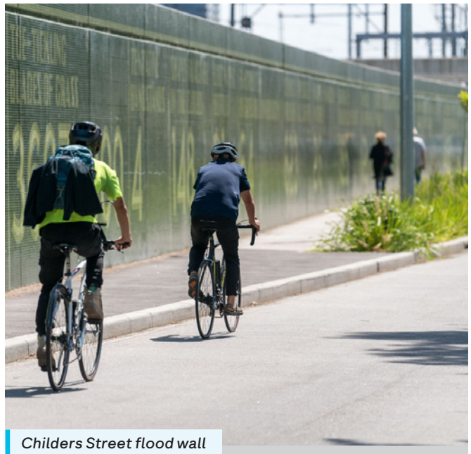
Childers Street flood wall

24 hour works are sometimes required during peak construction activities We will notify if out of hours works are required