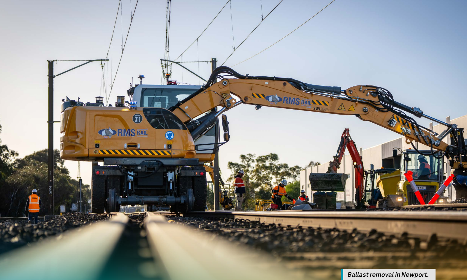
Ballast removal in Newport.