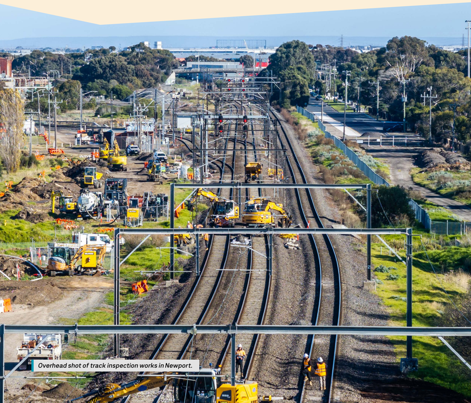
Overhead shot of track inspection works in Newport.

Sign up for SMS updates for the latest information by texting NEWPORT to 0429 839 892 or find out more by visiting levelcrossings.vic.gov.au/newport-disruptions