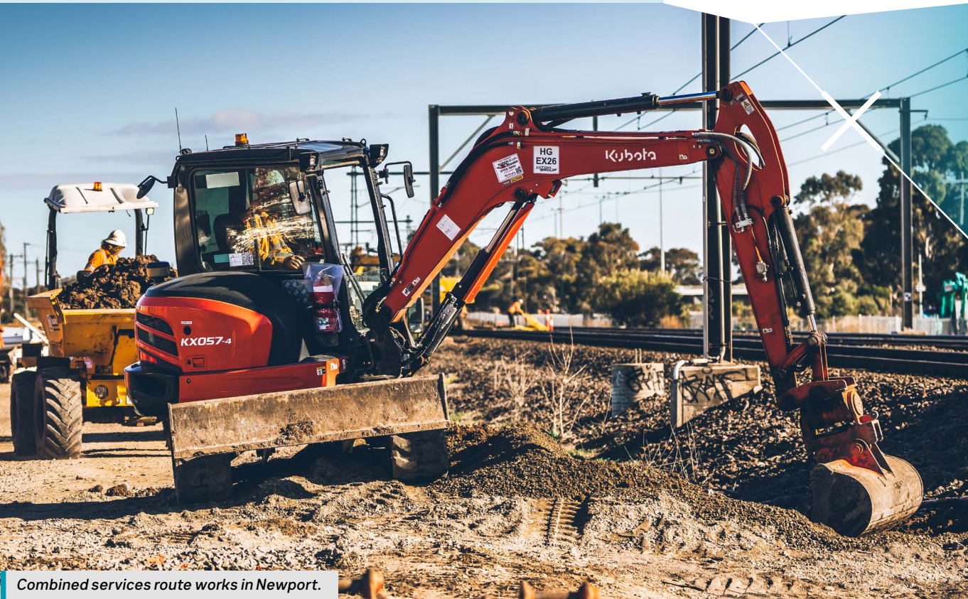
Combined services route works in Newport.

Once we've removed the level crossings in Newport, we'll plant 145 mature trees and up to 30,000 large plants, shrubs and grasses. This will increase the tree canopy and contribute to greening the local area.