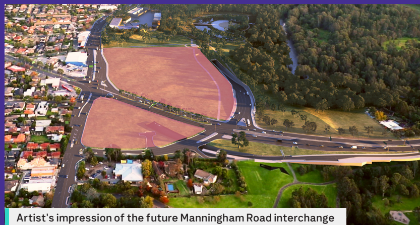
Artist's impression of the future Manningham Road interchange