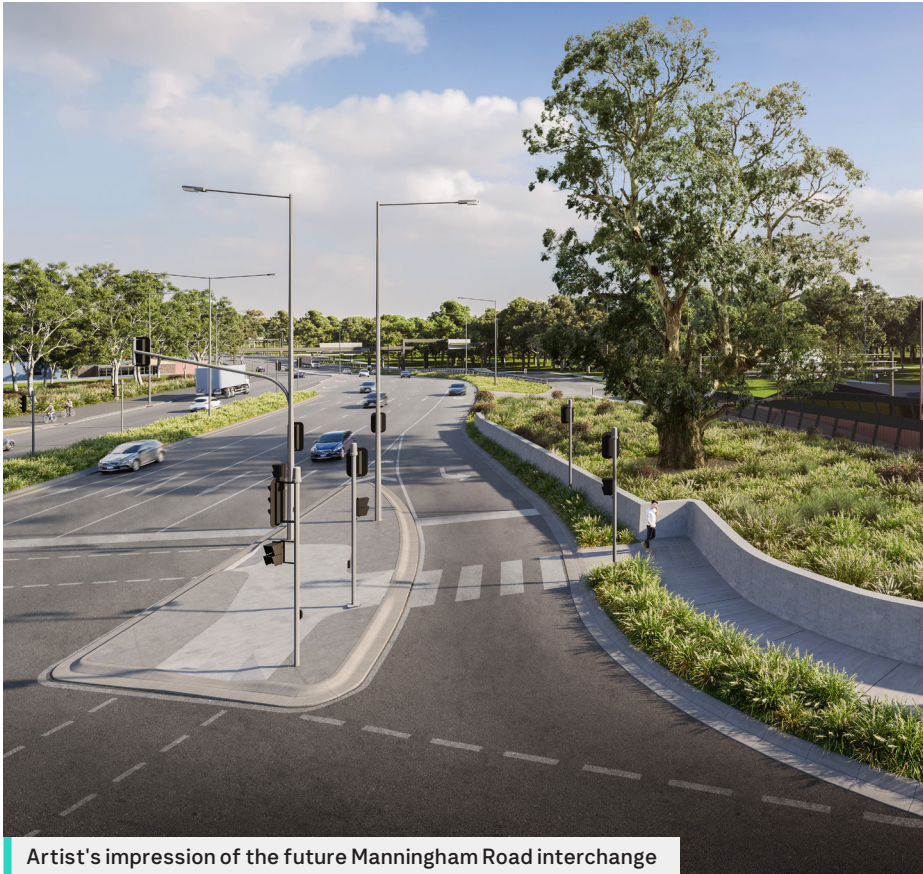
Artist's impression of the future Manningham Road interchange

Works are powering ahead on North East Link to build the new Manningham Road interchange. As part of these works, there will be changes to traffic conditions to allow crews to safely carry out construction activities.