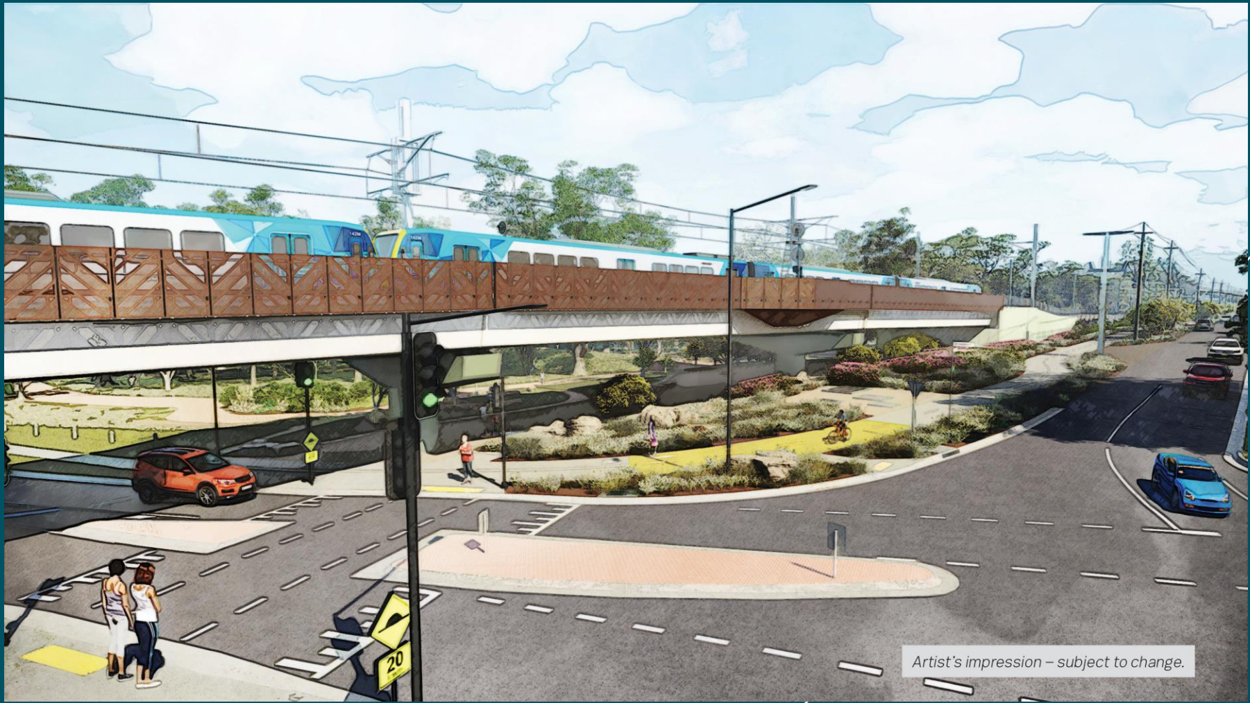
Artist's impression – subject to change.