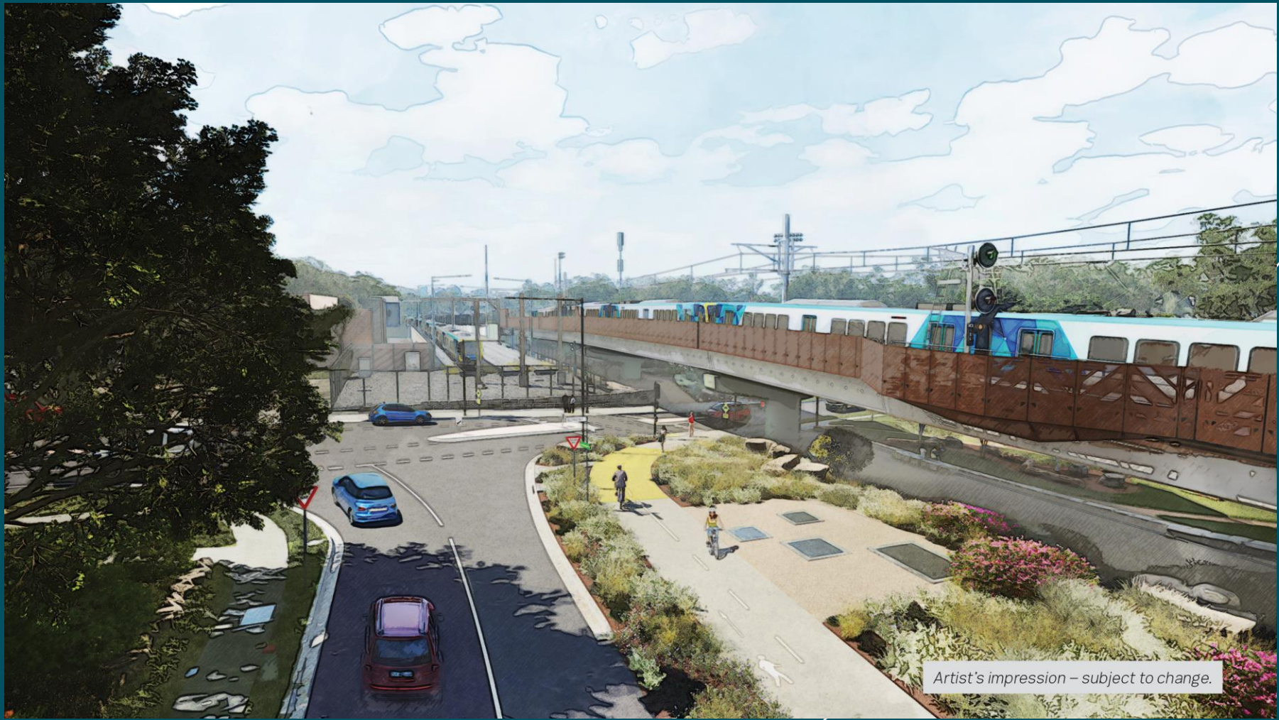
Artist's impression – subject to change.