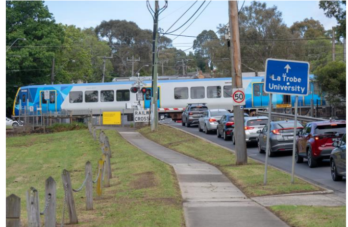
Boom gates down at the Ruthven Street level crossing