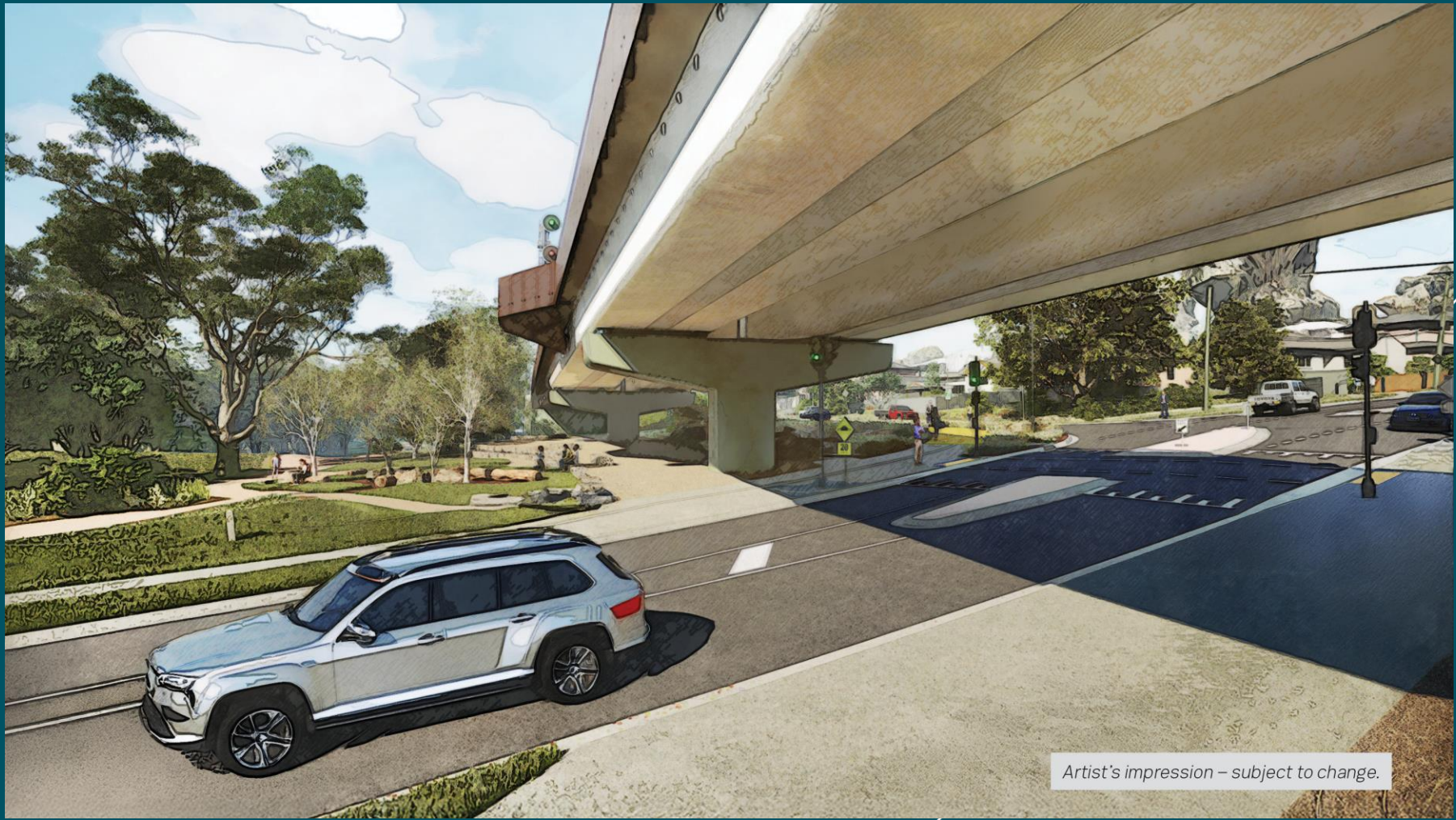
Artist's impression – subject to change.