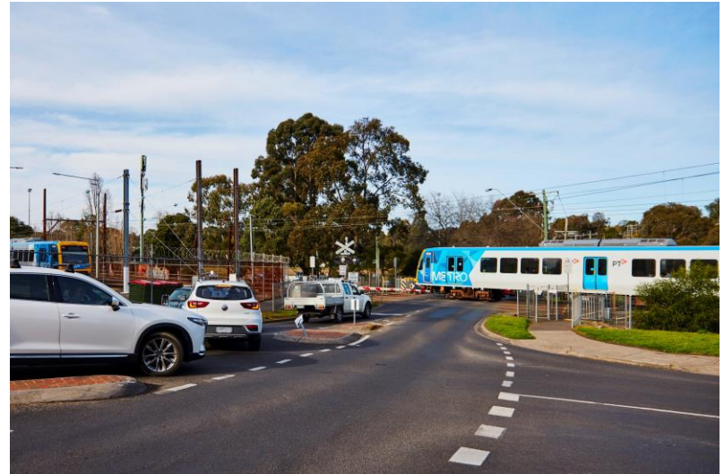
Boom gates down at the Ruthven Street level crossing.

Boom gates are down for nearly half an hour every morning peak (7am to 9am)