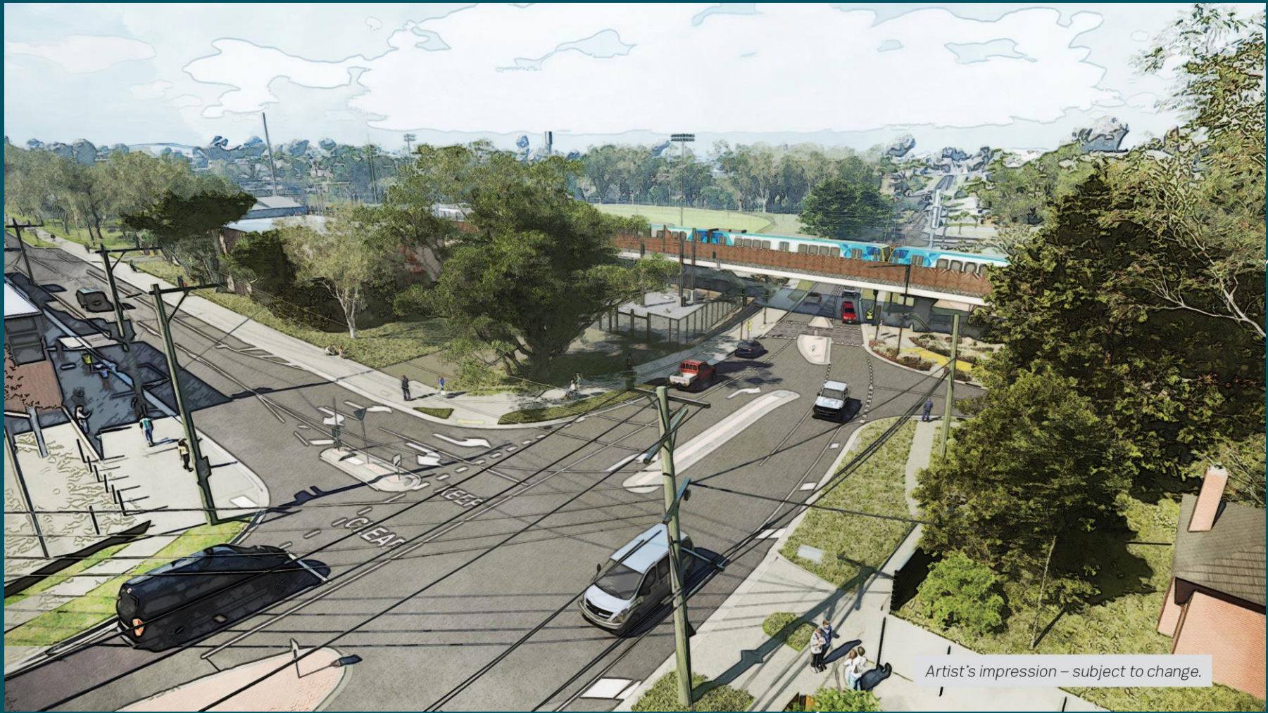
Artist's impression – subject to change.