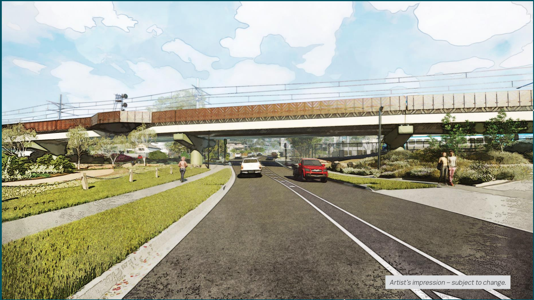
Artist's impression – subject to change.