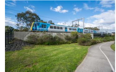
Clockwise from top: Rail bridge in Rosanna, cycling path along Ellesmere Parade towards Lower Plenty Road, and the rail bridge at Toorak Road