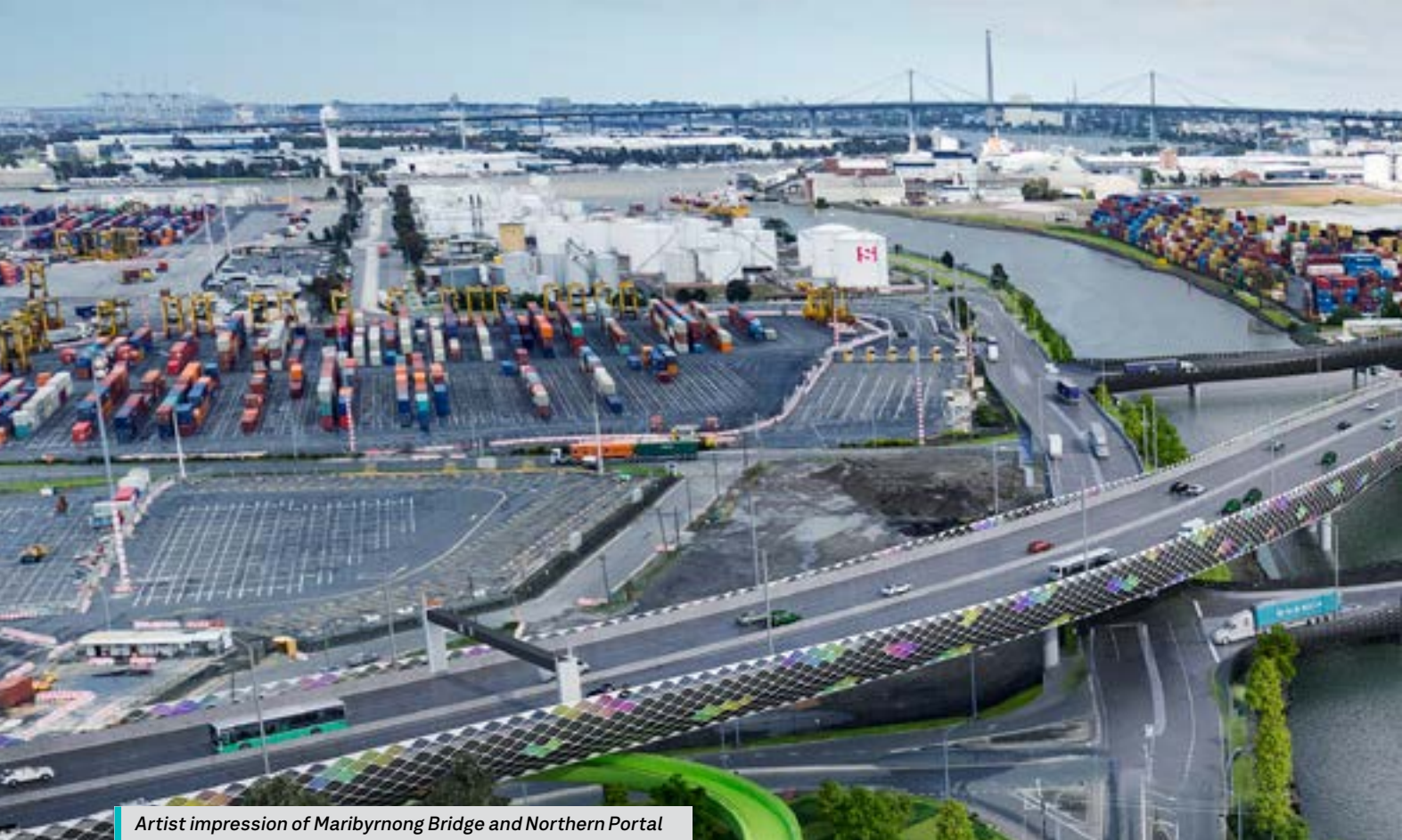
Artist impression of Maribyrnong Bridge and Northern Portal