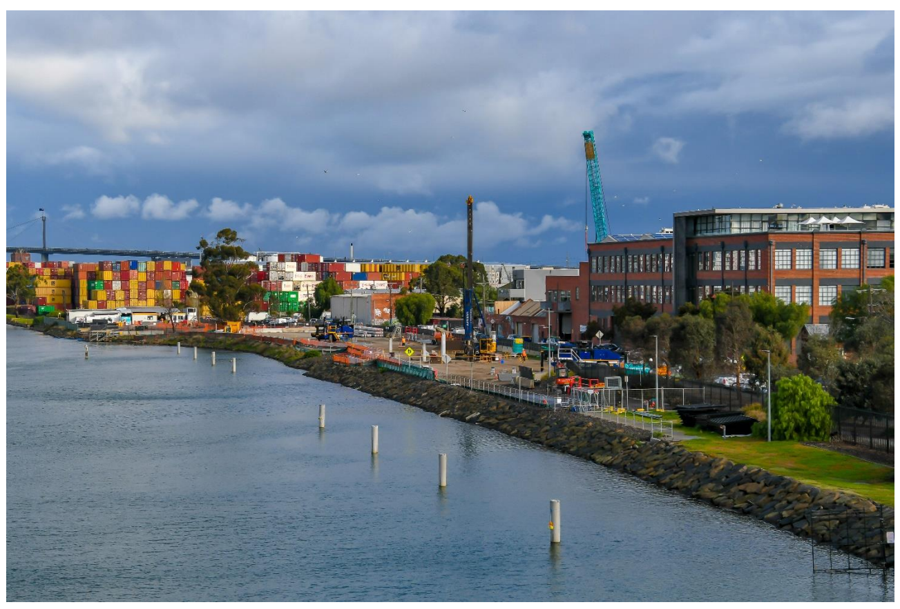
Figure 3- Construction site on west bank of Maribyrnong River