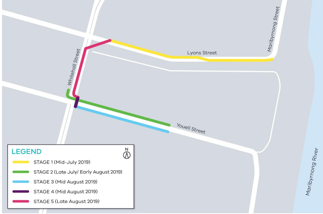
Figure 2- Power relocation works

Works have been scheduled to take place at night to minimise impact to the community.