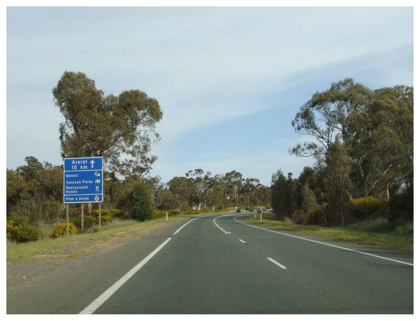
Western Highway – looking south towards Armstrong Deviation