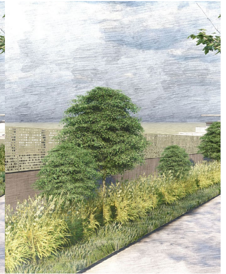
Larger shrubs and plants