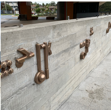
Sculptural artworks at various locations around the station precinct