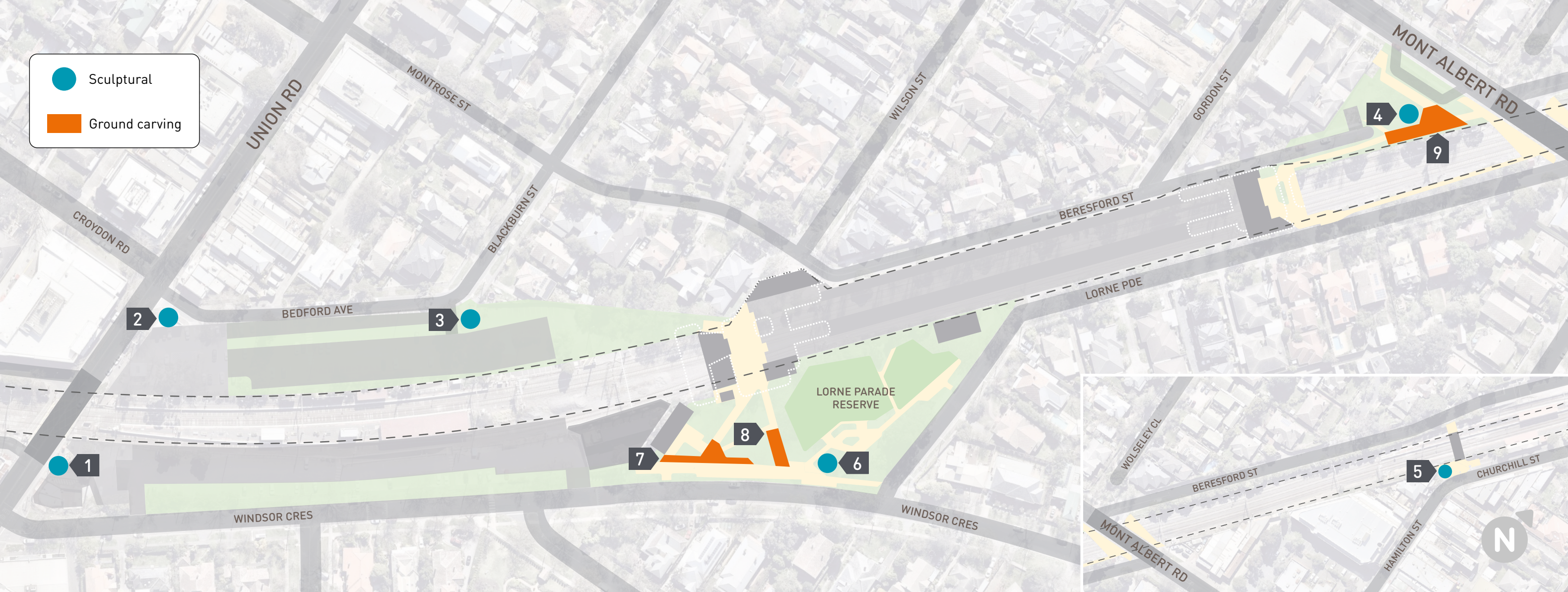
Potential public art locations