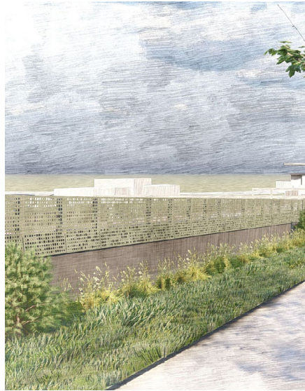
Smaller shrubs and plants