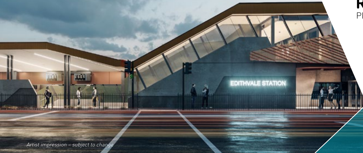
Artist impression – subject to change