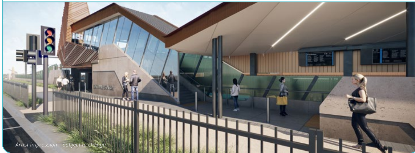
Artist impression – subject to change

In Edithvale, station forecourts and seating around the precinct will provide a comfortable and sheltered waiting space for commuters, identified by built in furniture, changes in unique paving patterns and feature arbours with climbing plants scattered around the station precinct.