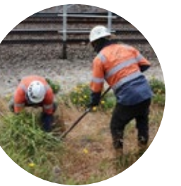
Crews safely removing vegetation for re-planting